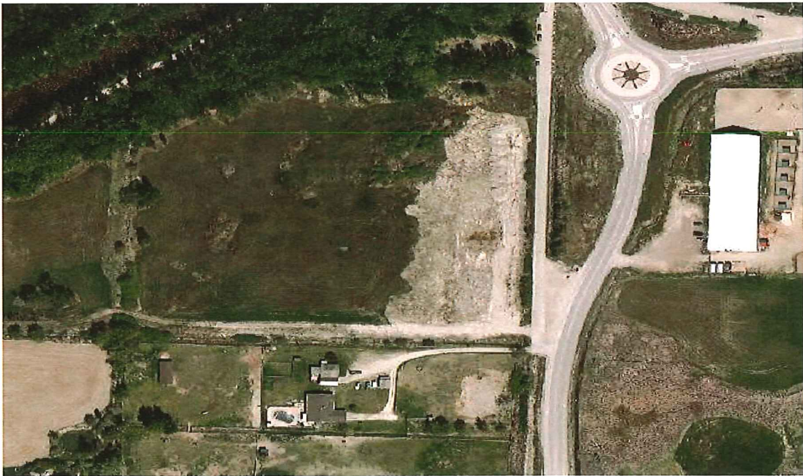
Photo 1: City of Kelowna ortho image dated 2012 showing fill placed on site after development of traffic circle and Swamp road drainage improvement.

It is worth noting that during this historical review, of the property that the fill currently placed without permission on the property is not the first fill to be placed on the property. Ortho image and Google Earth images reviews have confirmed that fill material from the development of the traffic circle and Swamp road drainage improvements have been placed on the property as early as 2009 and possibly earlier. (Refer to photo 1 below)