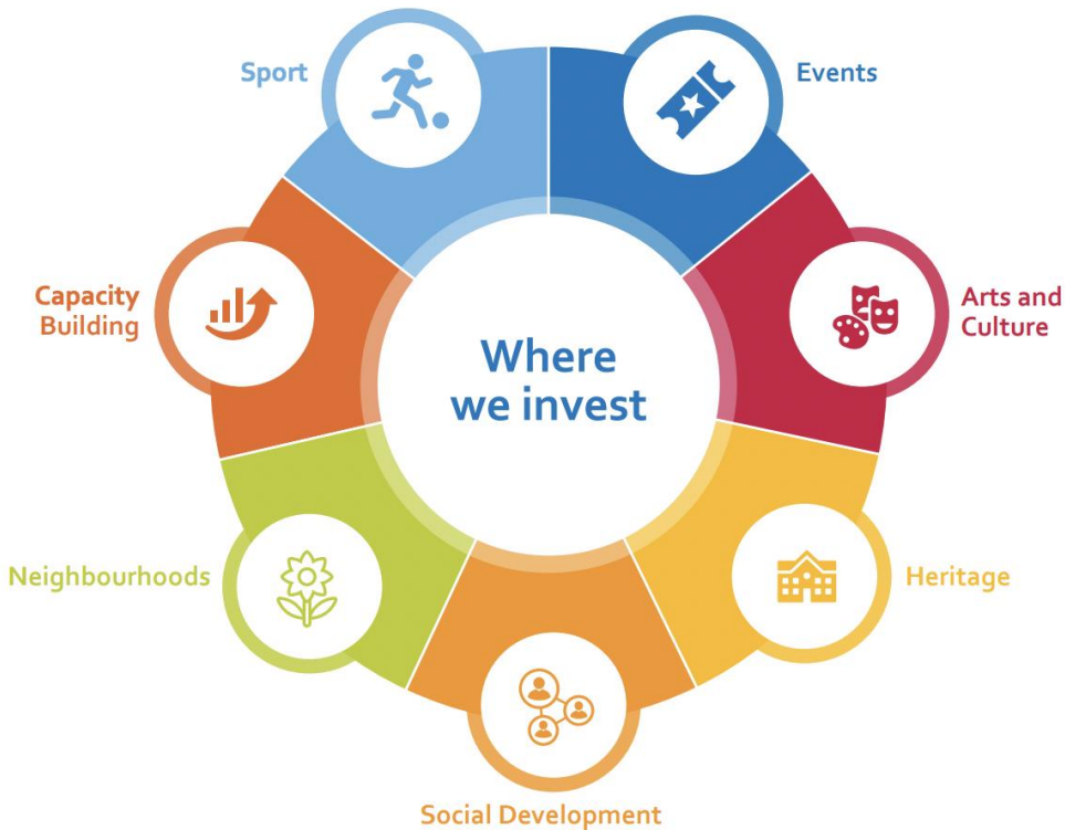
Figure 1: Where we invest

Figure 1 demonstrates the diverse areas where investments were made in support of our local non-profit organizations through 2019 and 2020. Some of these investment areas include multiple programs available to the sector.