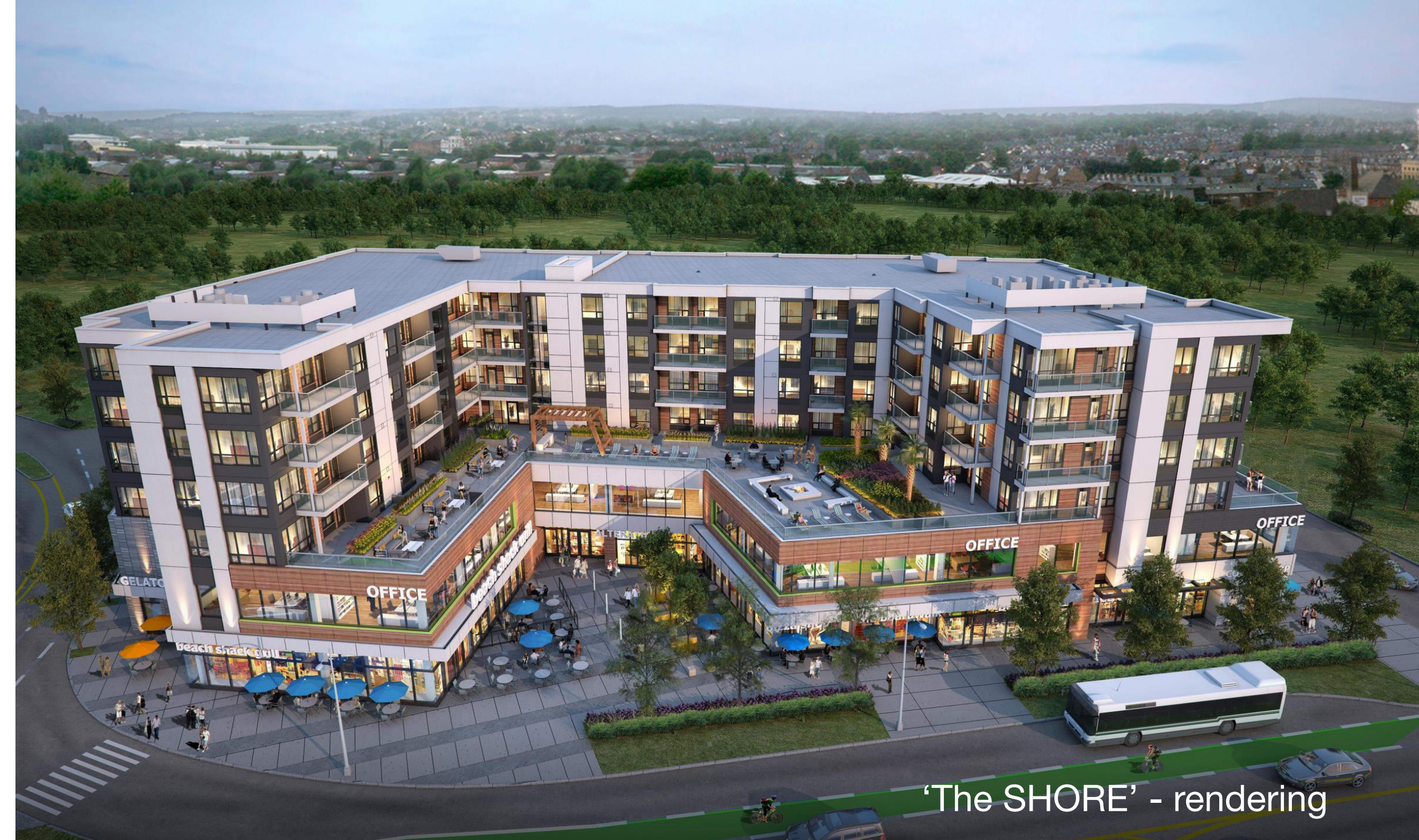
'The SHORE' - rendering