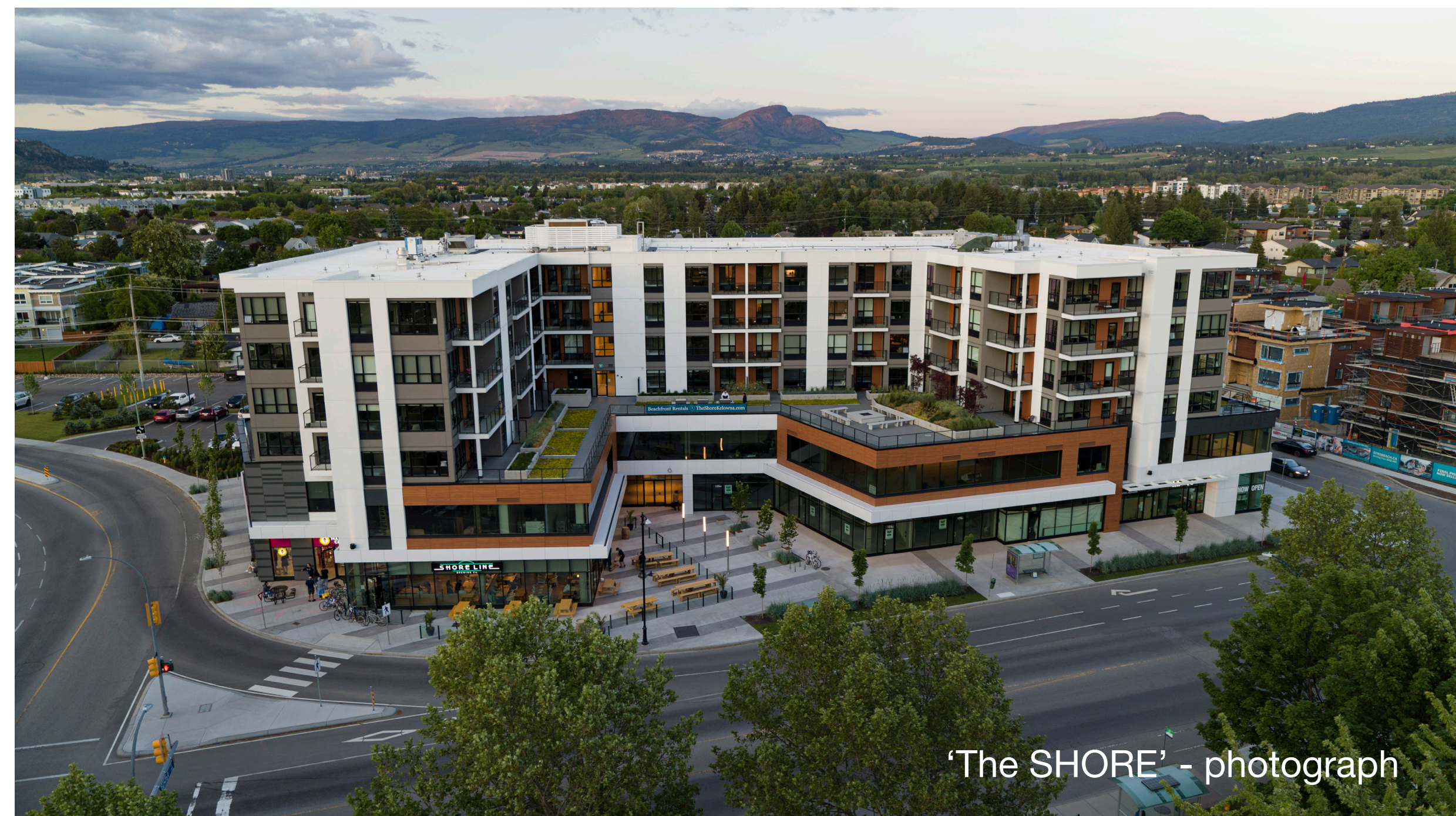
'The SHORE' - photograph