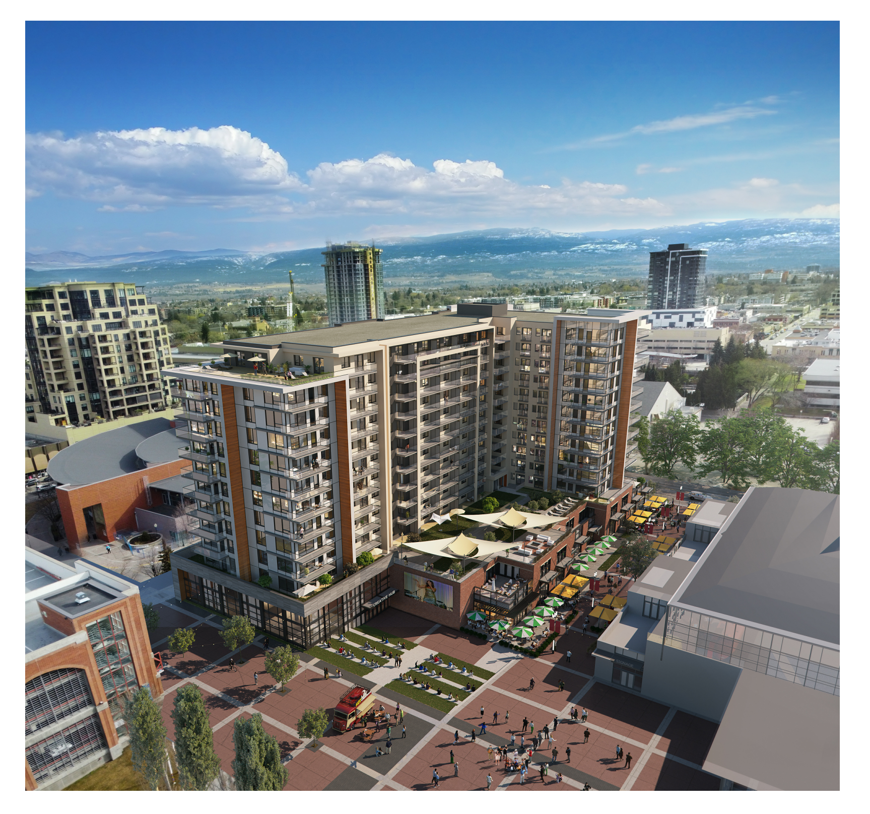
NORTHWEST BIRDS EYE