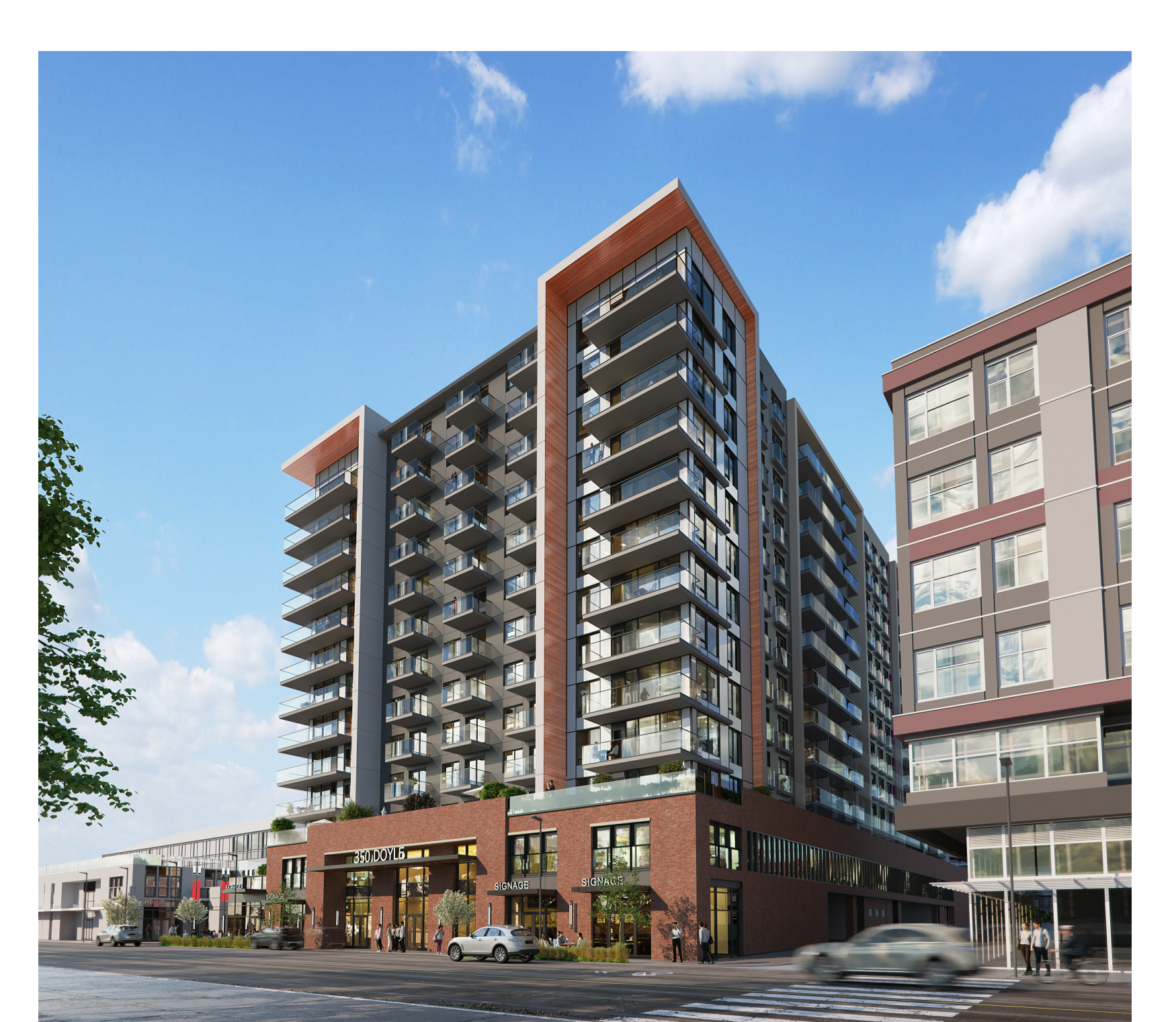
DOYLE AVENUE SOUTHEAST PERSPECTIVE