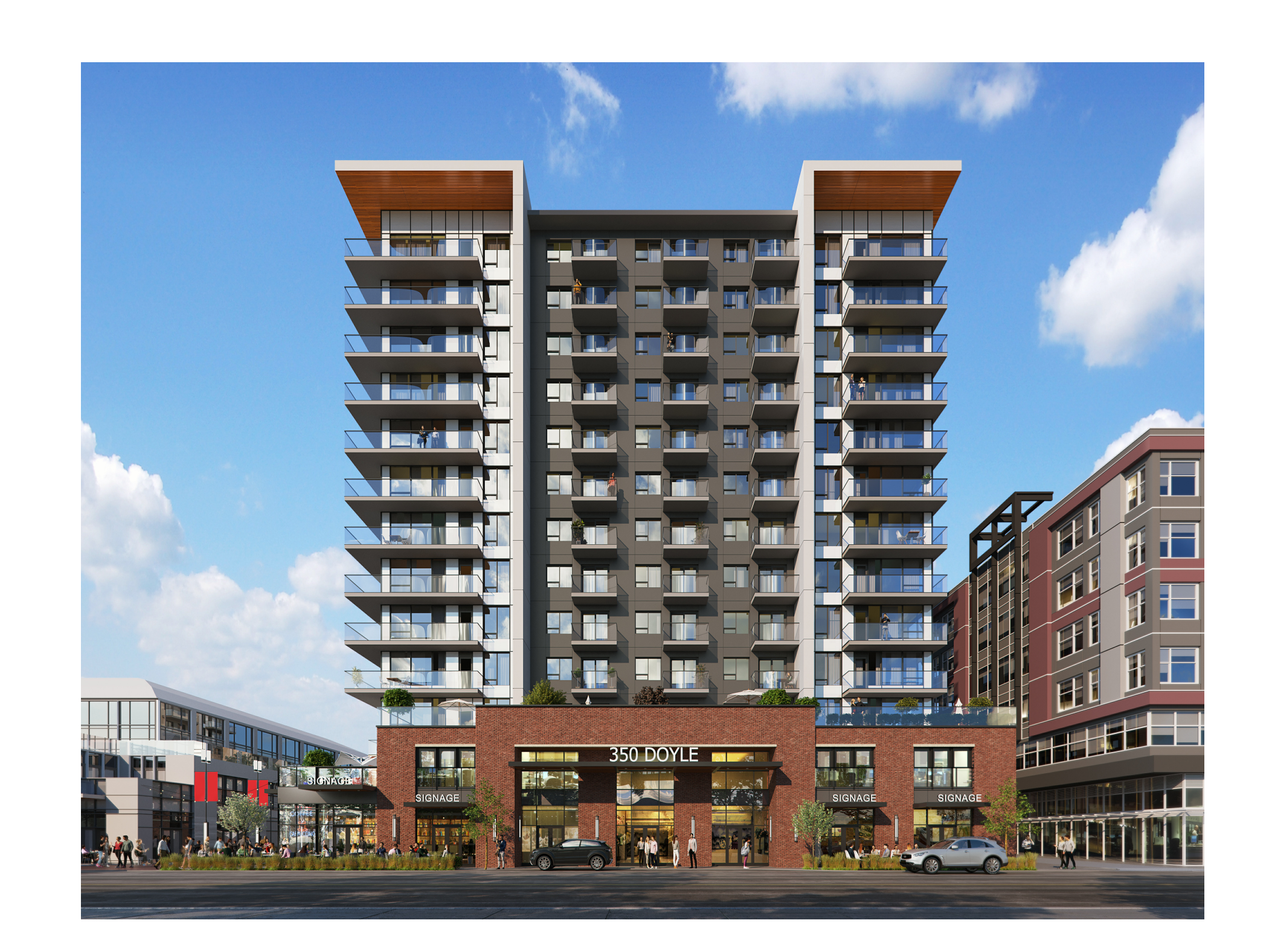
DOYLE AVENUE SOUTH PERSPECTIVE