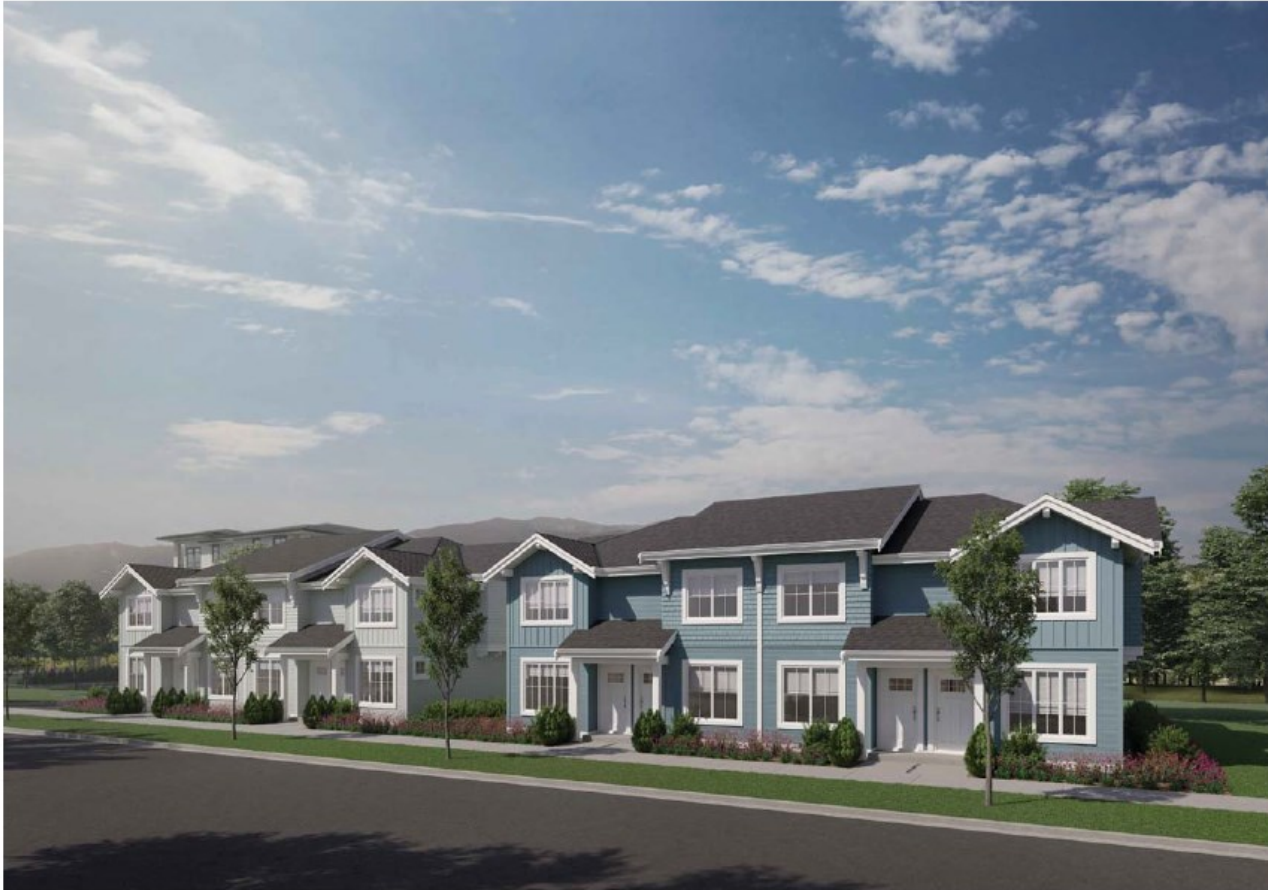
Townhomes A1 & A Facing Central Avenue