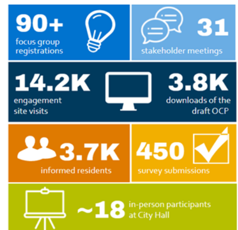
Figure 2: Phase 4 Engagement Participation