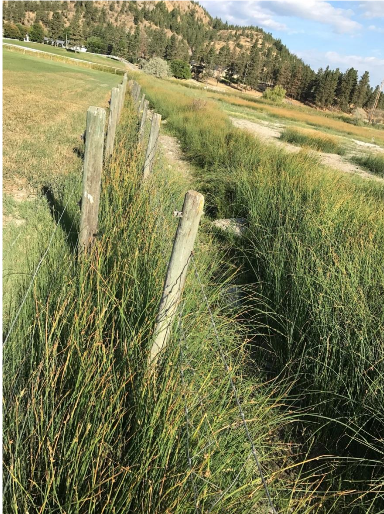
Photograph 2: Interception Ditch on North of Parcel

Again, the water will flow to the existing ditch (see Photograph 2) and follow the normal path to the lake.