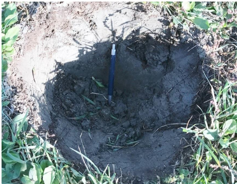
Photograph 1: Soil Pit in Area to be Drained

Flushing the salts over time is the known remedy for this action. Normally, the farmer uses tile drainage to remove the salts which are dissolved in the irrigation water. While effective, tile drainage is also expensive. In addition, the Scheffler property contains heavy clays (see Photograph 1) and the ability for water to drain through the clays is suspect. The higher knolls on the property on the south along the driveway do not exhibit the same effect of alkalinity or salt saturation. Water from these knolls will drain along the surface to the lower part of the pasture which is the subject of this proposal.