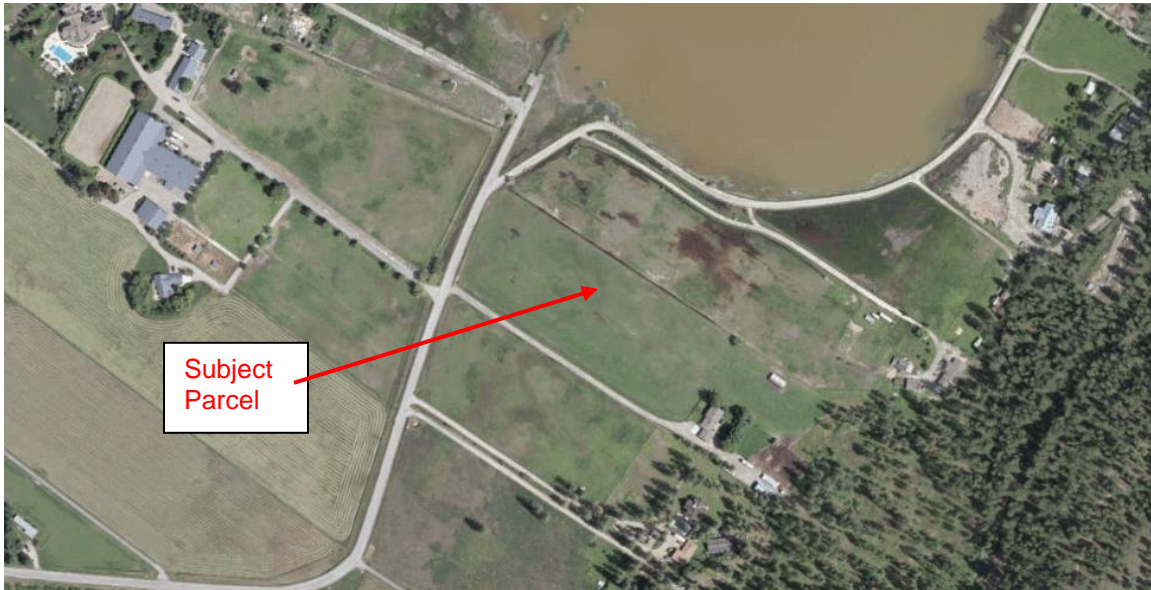
Figure 1: Location of the Scheffler Property

The location of the property is shown in Figure 1: