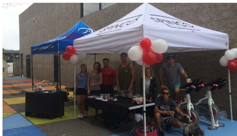
Canada Day / SPINCO Birthday