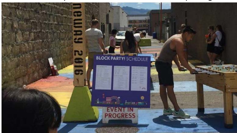
Outdoor Rec Room at the Block Party 2016