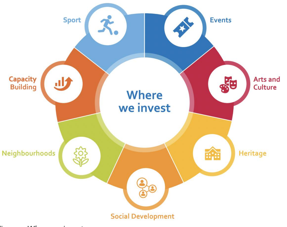
Figure 1 demonstrates the diverse areas where investments were made in support of our local non-profit organizations through 2019 and 2020. Some of these investment areas include multiple programs available to the sector.