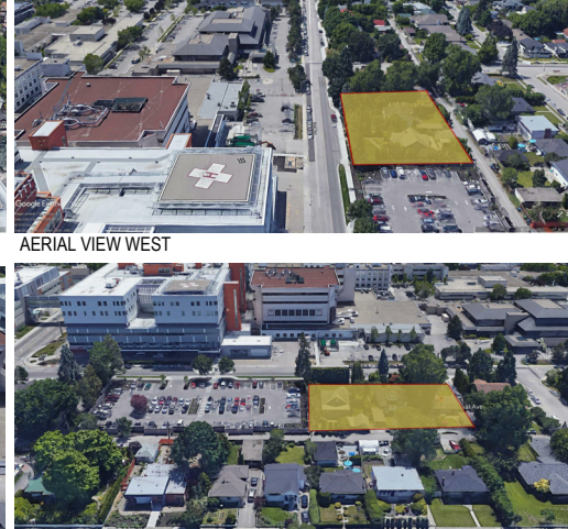
AERIAL VIEW SOUTH