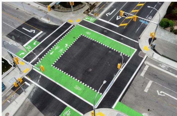
Figure 1 Ethel and Sutherland is the first intersection where two protected bike lanes meet in Kelowna.

The City is pleased to accept this award from the Share the Road Cycling Coalition designating Kelowna as a Bicycle Friendly Community at the bronze level. The award recognizes the significant efforts made in Kelowna over many years to fill the gaps in our bicycle network and adopt bicycle-friendly policies in various City plans and bylaws. As part of this award, the Share the Road Cycling Coalition has provided