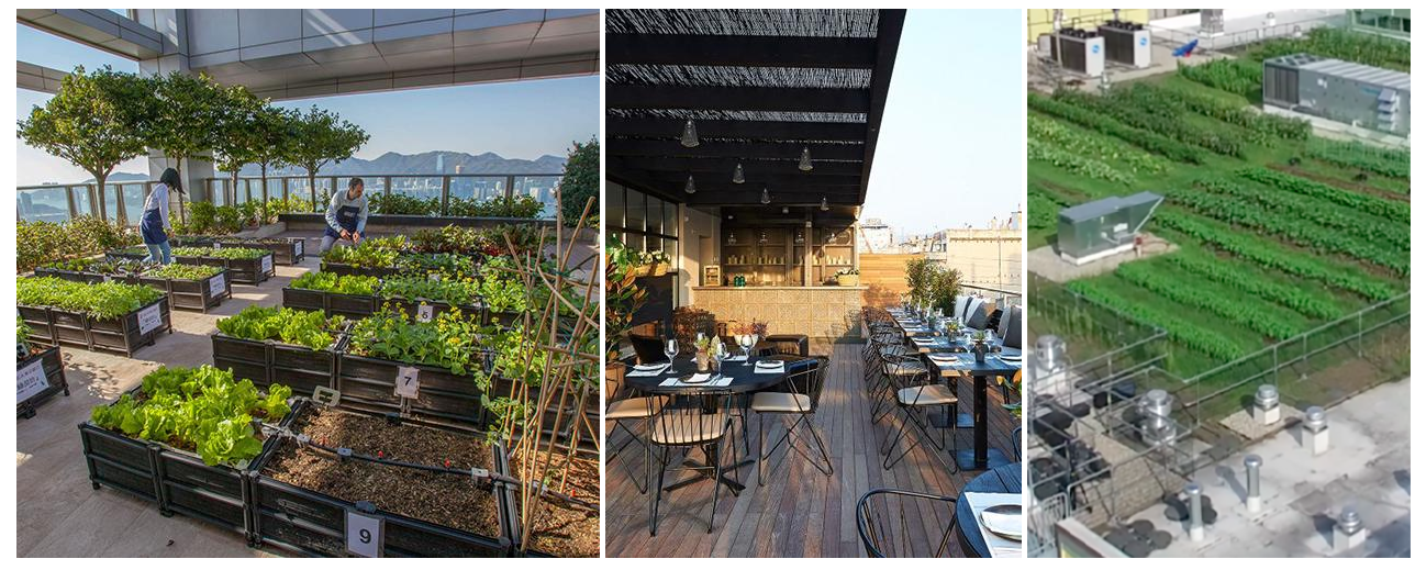
Sample Images Rooftop Food Production & Private Tasting