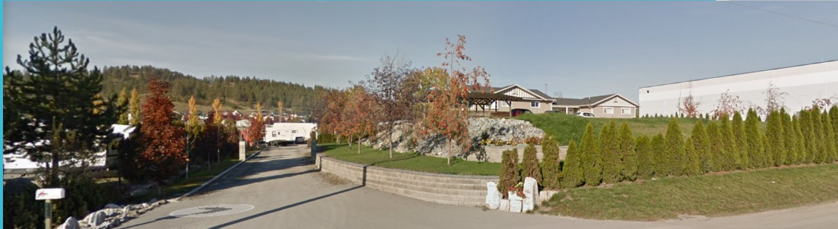
3030 Sexsmith Rd