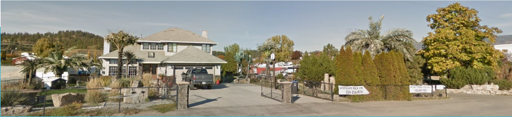
2996 Sexsmith Rd