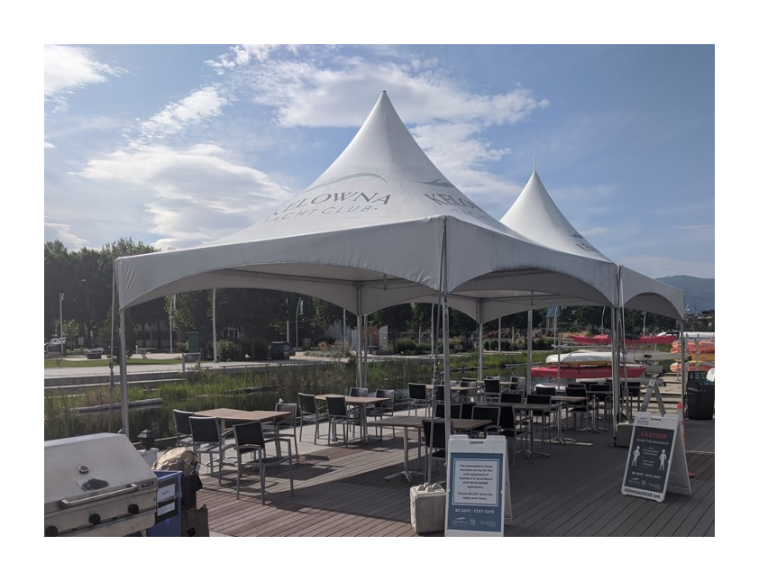
Kelowna Yacht Club