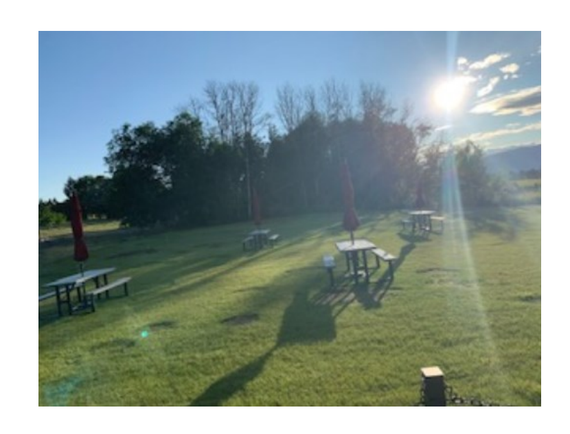
Forbidden Spirits Distilling Co.