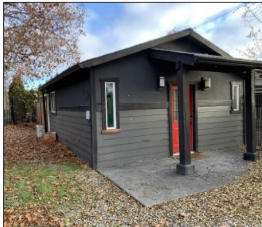
Proposed carriage house