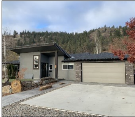
Subject property frontage