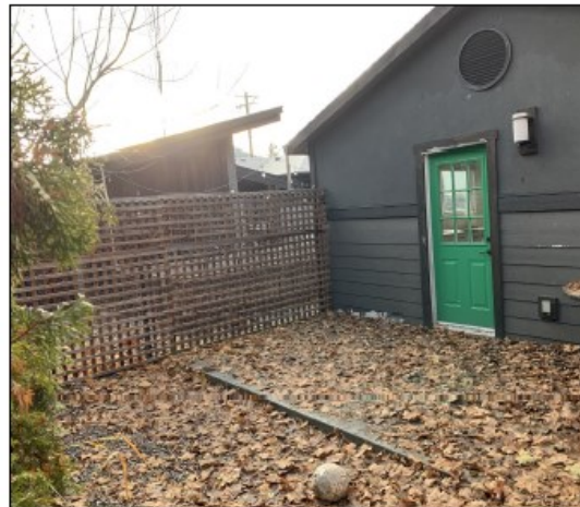
Existing rear yard—carriage house