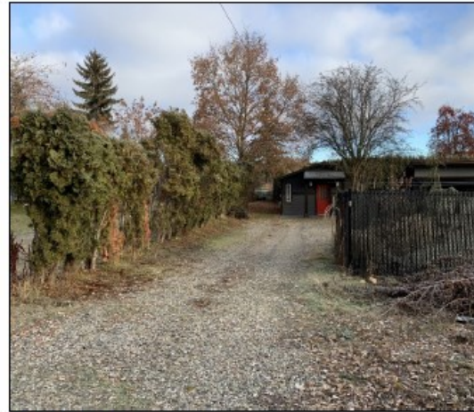
Dallas Rd. access