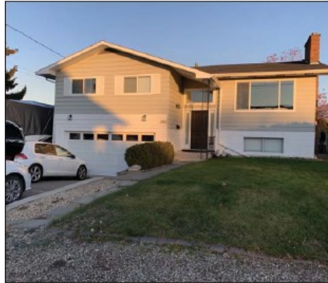
Subject property frontage (west)