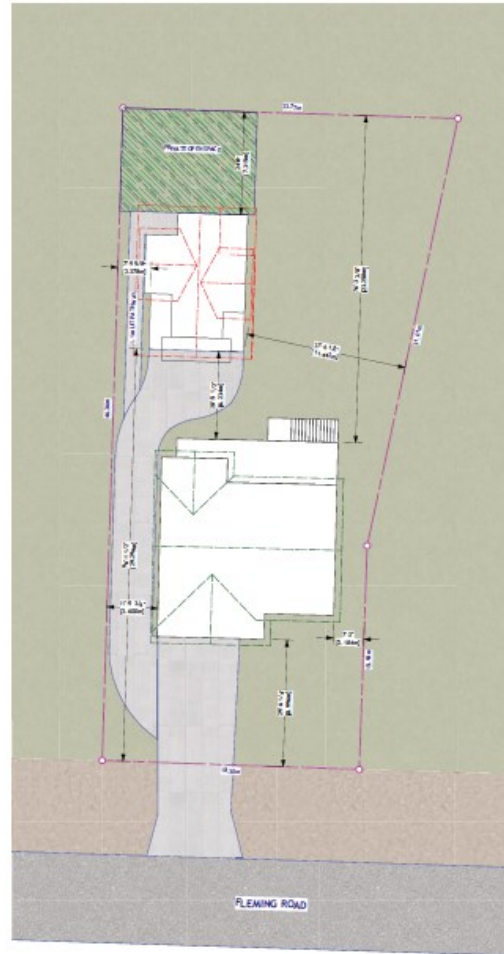
1 SITE PLAN Scale: 1:150