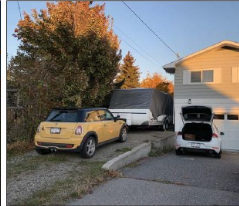
Side-yard access (north)