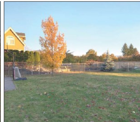
Rear yard (tree to remain)