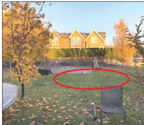
Proposed carriage house location (trees to remain)