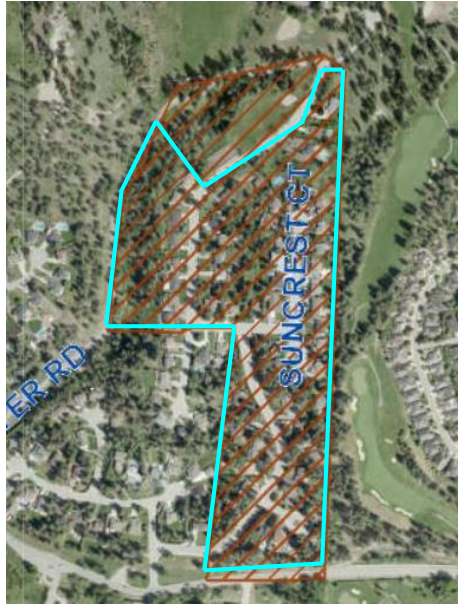
Properties to revert to RR3