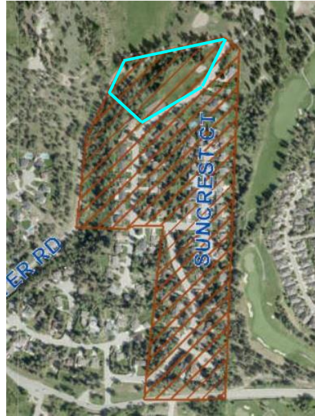
Property to revert to P3

The Land Use Contract uses and regulations fit within the RR3 – Rural Residential 3 & P3 – Parks and Open Space zone however, the new zone does permit more uses (e.g. secondary suite).