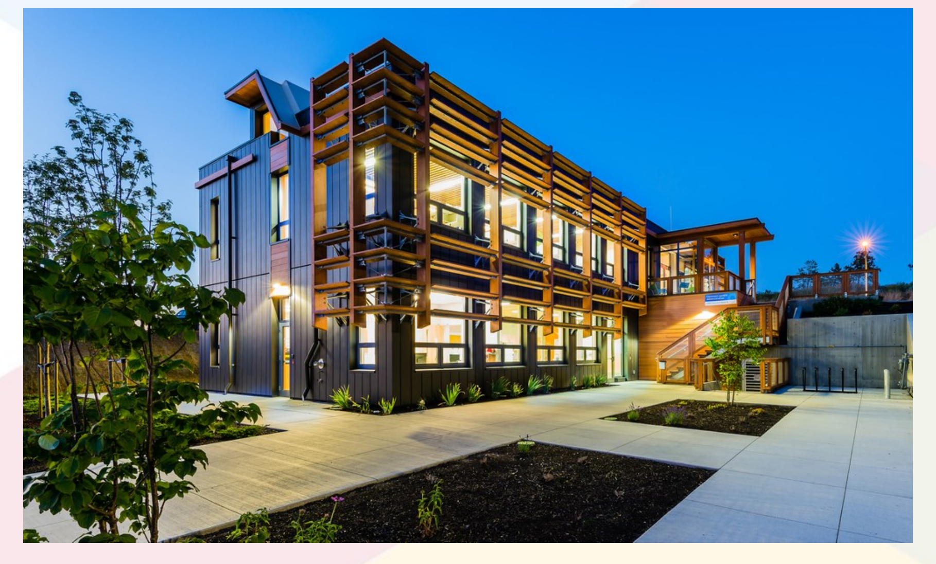
"The City's actions align with strategic objectives to achieve a range of short and long-term benefits for the municipality and the residents of Kelowna."