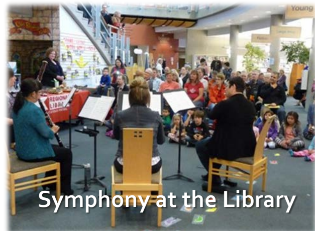
Symphony at the Library