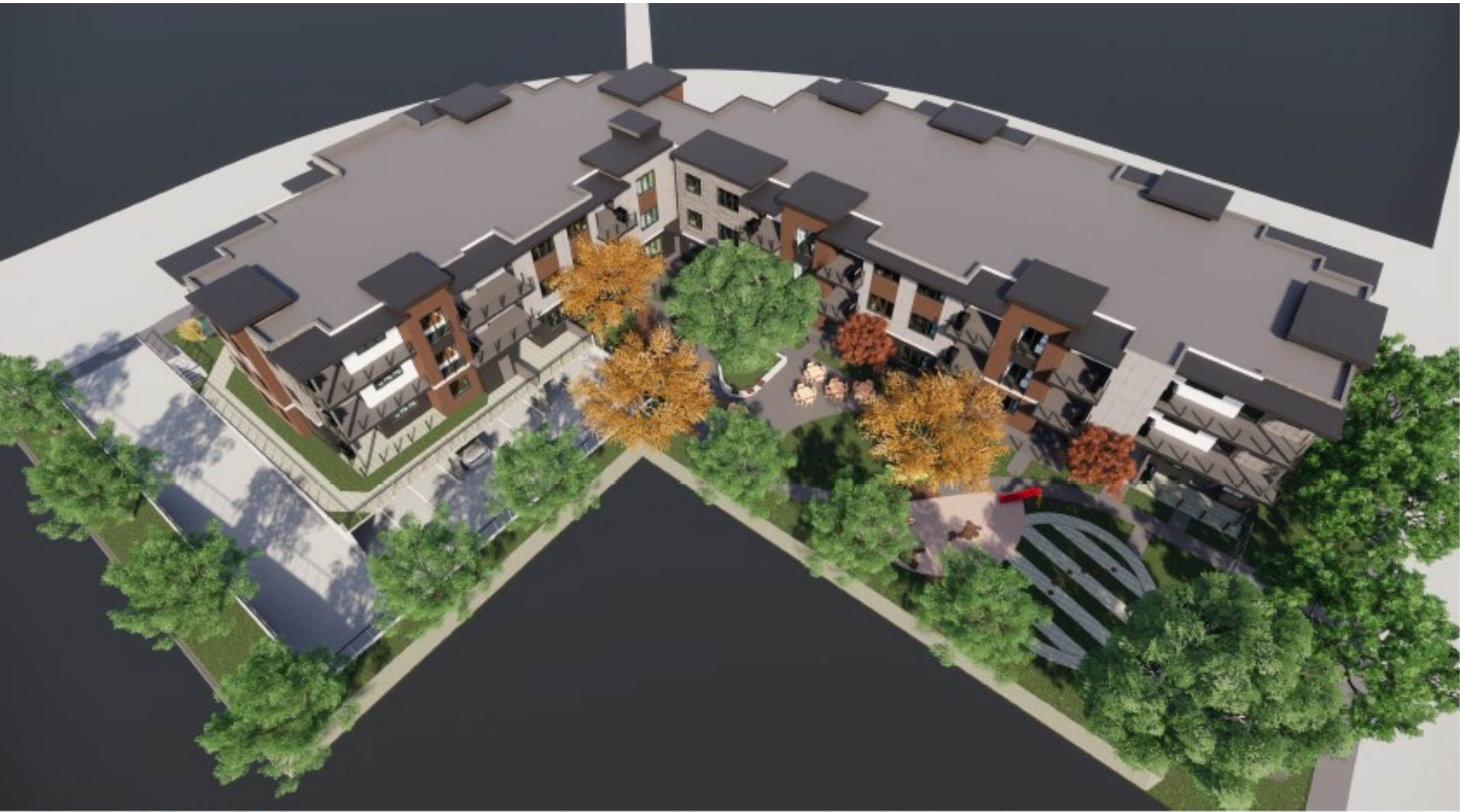
SITE OVERVIEW - BIRDSEYE PERSPECTIVE