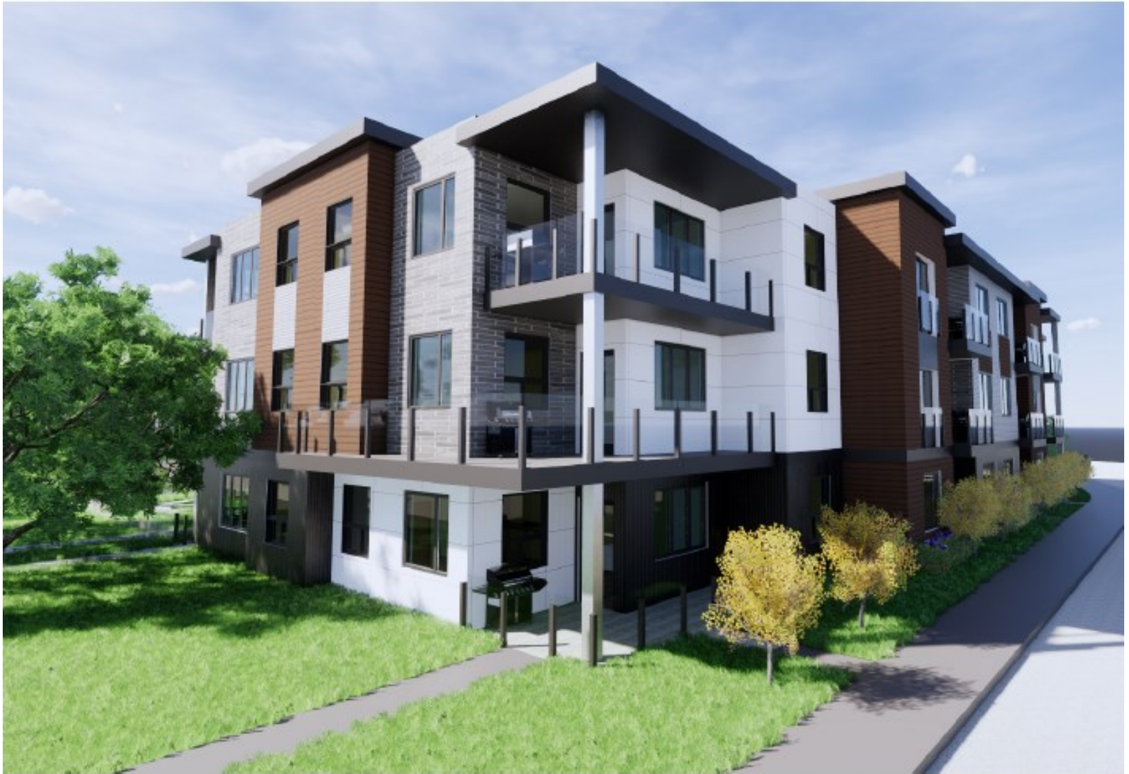
VIEW FROM RUTLAND x ROBSON ROAD INTERSECTION