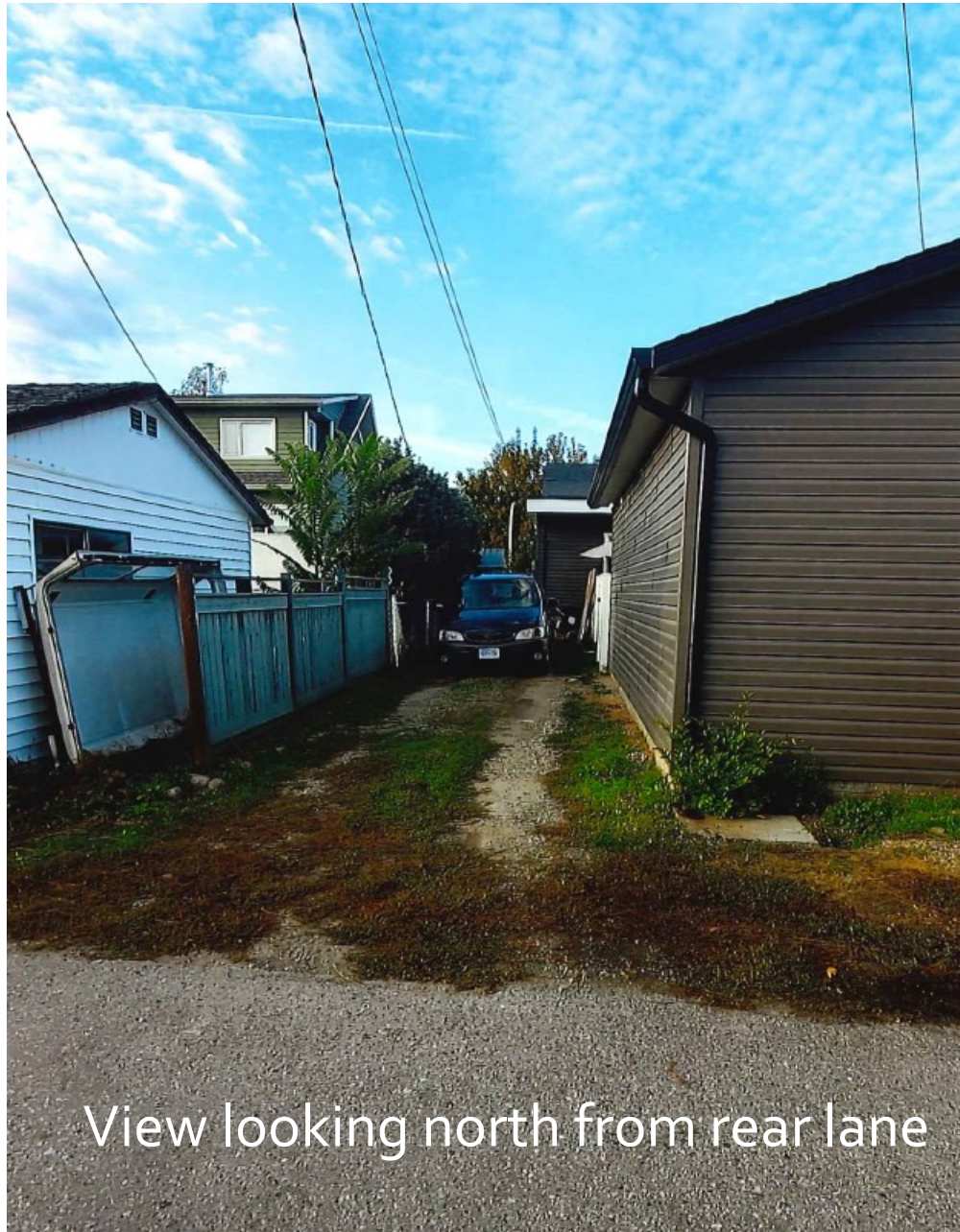
View looking north from rear lane