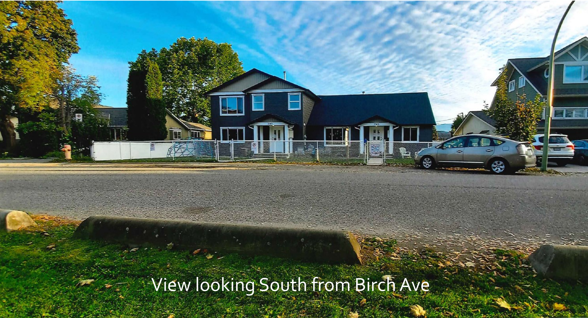
View looking South from Birch Ave