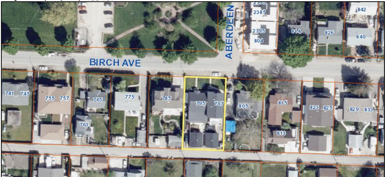
Subject Property Map: 795-797 Birch Ave