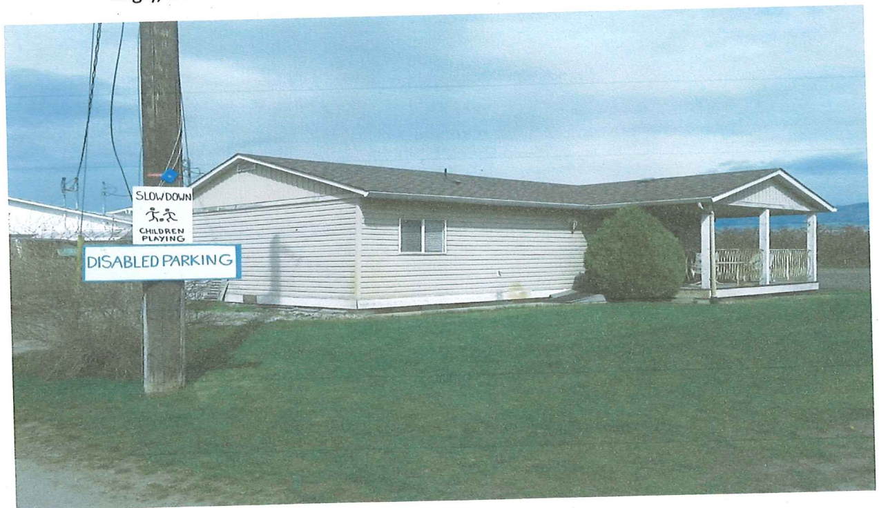
Photo 5: the patriarch's house to be renovated once vacated. Approximate size 800 ft. sq.