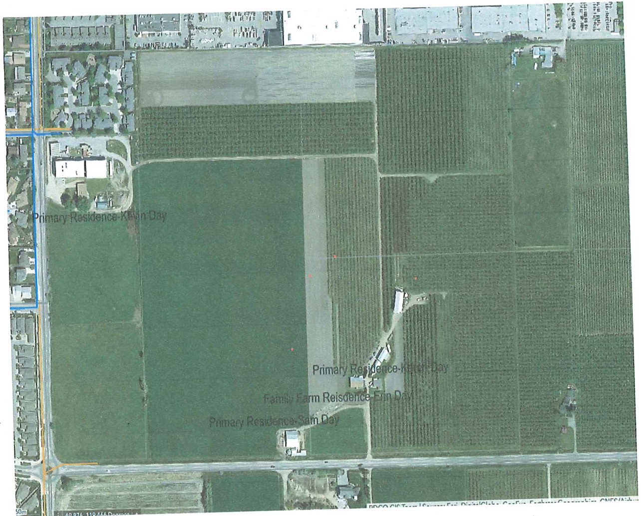
Photo 3: showing final layout of Primary residences on each lot, and a shared farm family residence (note: all residences proximate to roads, in proximity to fruit stands or packing facilities and no loss of productive farmland)