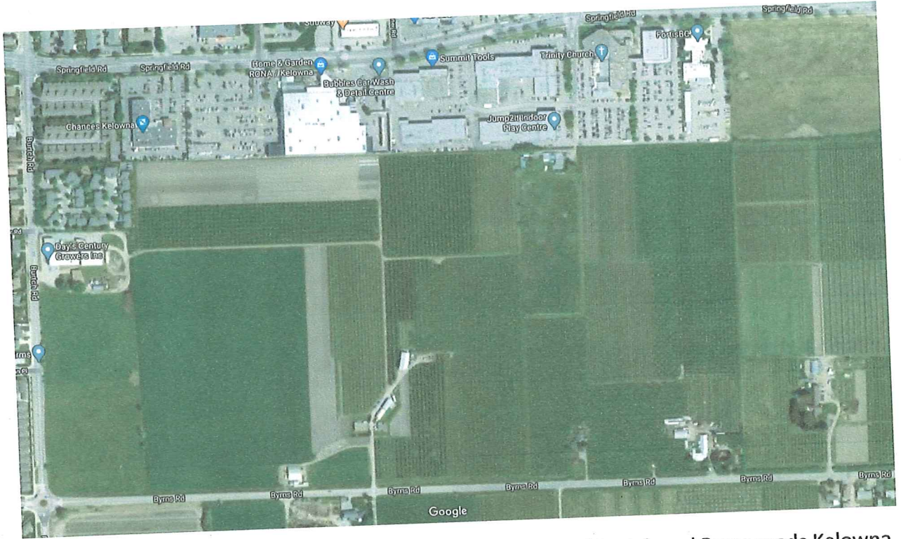
Photo 1: Overview of Owned Farm properties at N.E. corner of Burtch and Byrns roads Kelowna.