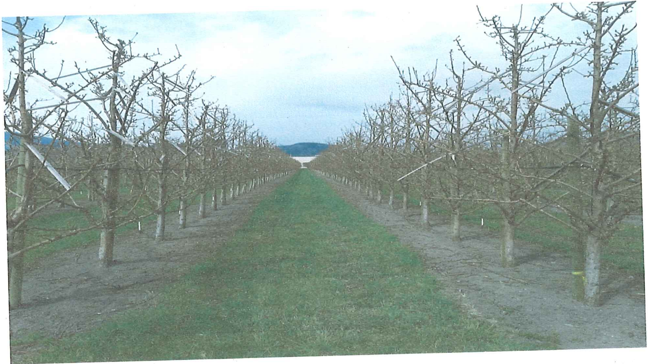
Photo 2: high yielding pear production pruned and ready for the 2020 production season. This level of management is well above industry standards.

Farm Future: Should the application in question, be successful, specifically, to build a 1600 sq. ft house for Riley and Erin to live in and stabilize the farm labour supply, ensure the continued operation of the packing plant and learn the annualized cycle of running a mixed farm and woodlot, they should live on the farm. This would mean, for some period of time, there would be three residences at the Byrn's road site: