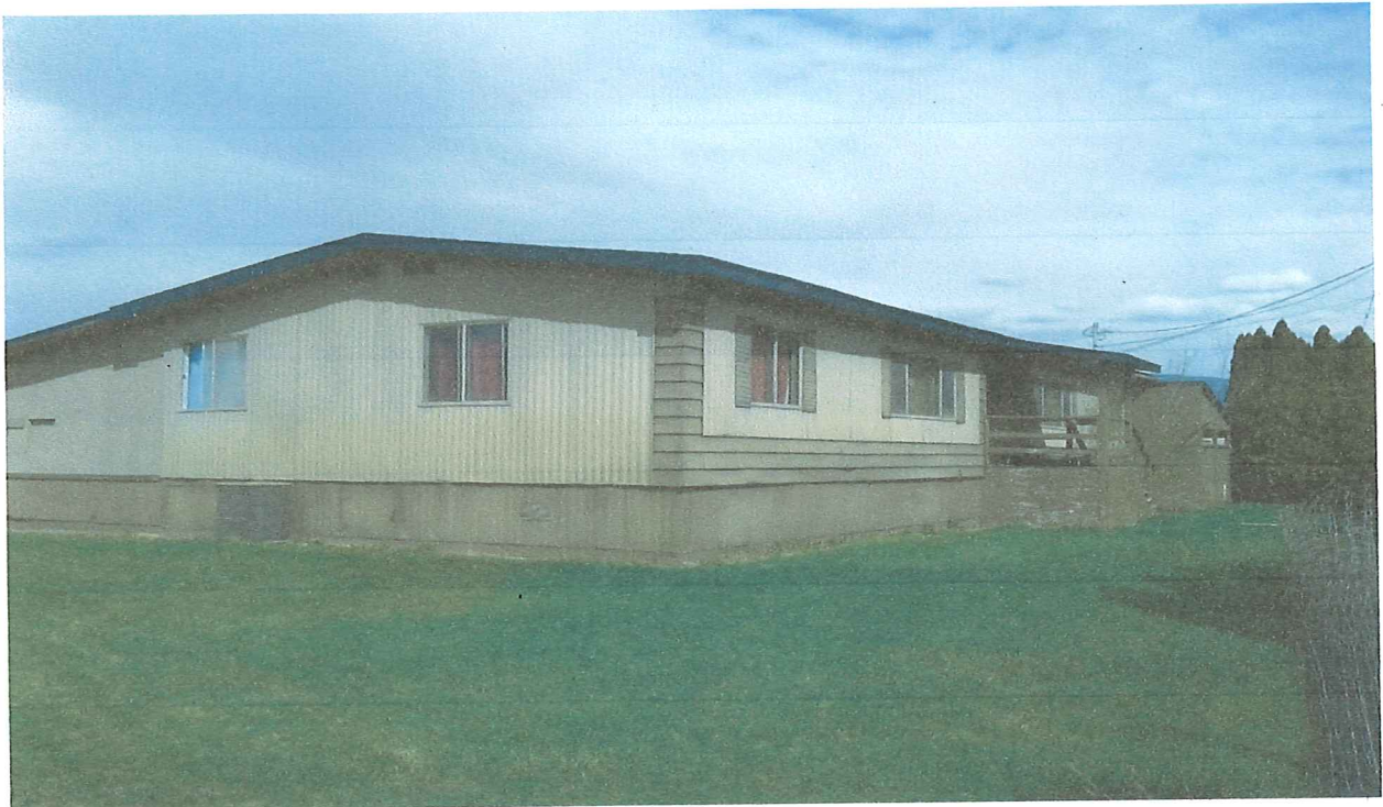
Photo 5; the “double wide” to be removed once farm family housing is constructed.

Recommendations: In reviewing the farming and packing facilities, interviewing family members, walking the farm and reviewing documents such as the City of Kelowna agriculture plan, the Agricultural Land Commission website I have confidence that the construction of a house for Erin and Riley at the location proposed minimizes loss of agricultural land, meets the requirements of the ALC Act, encourages a smooth farm family succession plan, respects the efforts of senior Day family members in building a successful, vertically integrated, resilient farm and allows people to age in place.