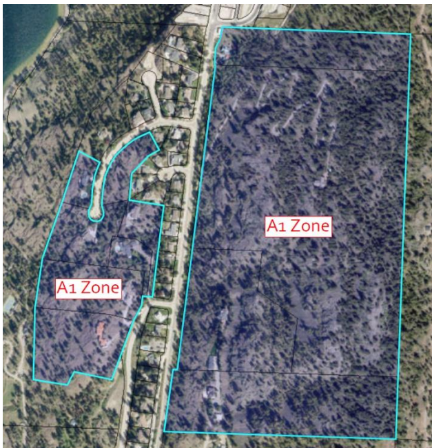
A1 – Agriculture 1 zone (Refer to Schedule 'A')

Staff are bringing forth and recommending this Land Use Contract (LUC77-1023) be terminated with a majority of the properties requiring rezoning to a more appropriate zone. Out of the 11 total properties currently regulated by LUC77-1023, 4 have appropriate underlying zoning of A1 – Agriculture 1, with the 7 remaining properties requiring rezoning to the RR1 – Rural Residential 1 and RR2 – Rural Residential 2 zones. The underlying zone of A1 – Agriculture 1 does not entirely fit within the established neighbourhood and is not an appropriate land use for all properties.