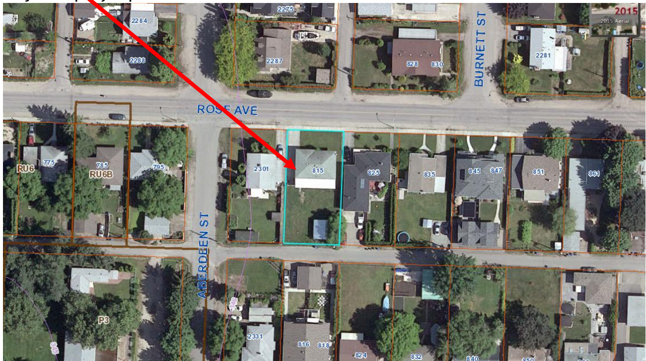
Subject Property Map: