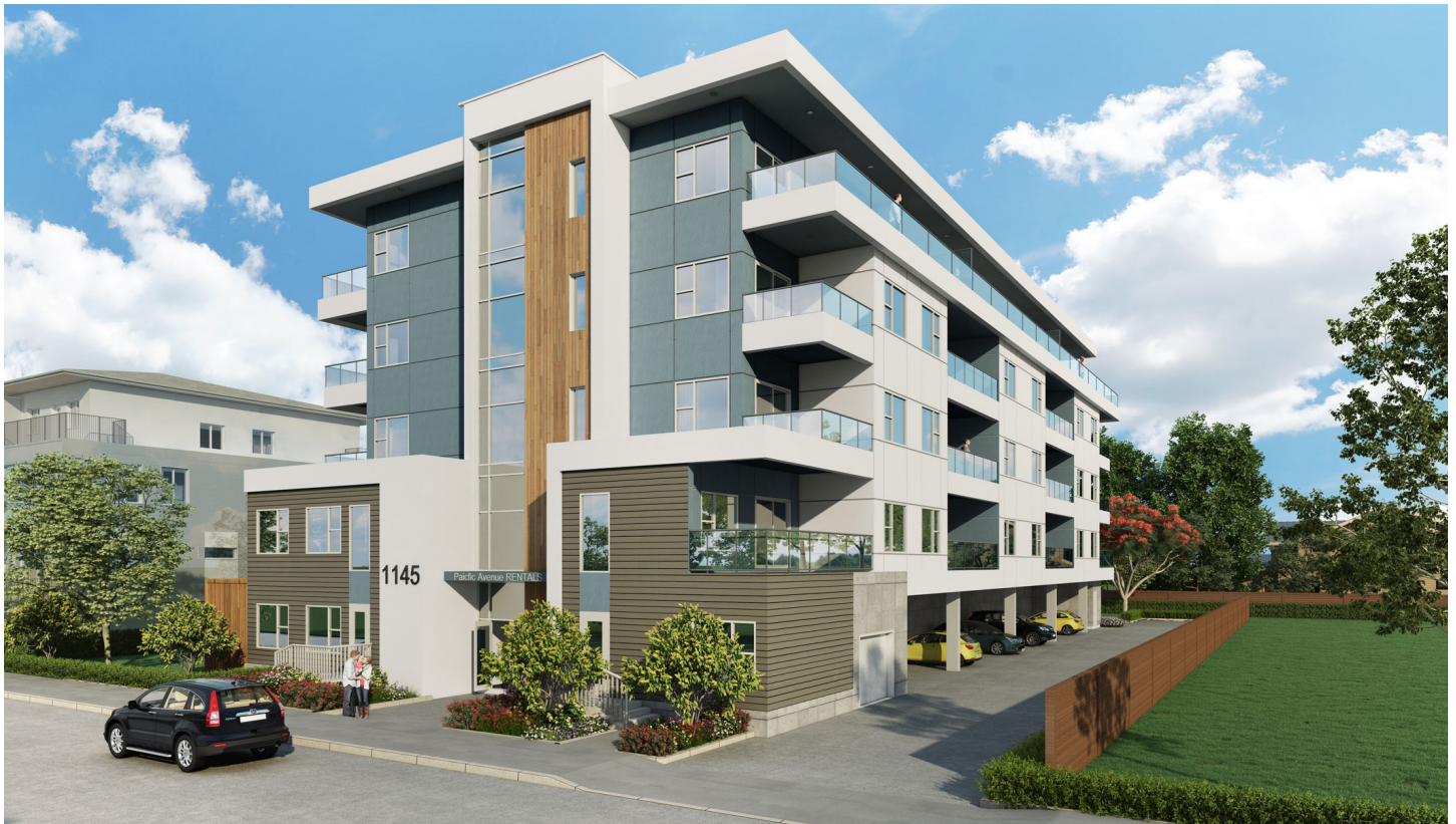
Main entrance of building with north elevation of building from Pacific Avenue.