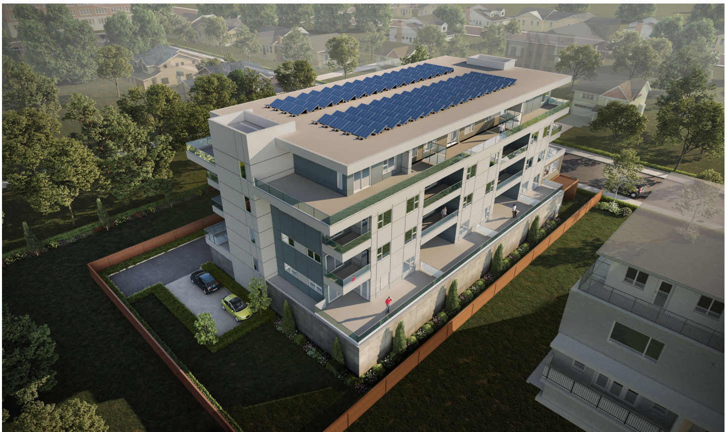
Rear of building looking at east elevation of building.