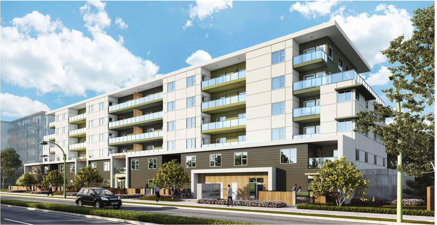
Main entrance of building with north elevation of building.