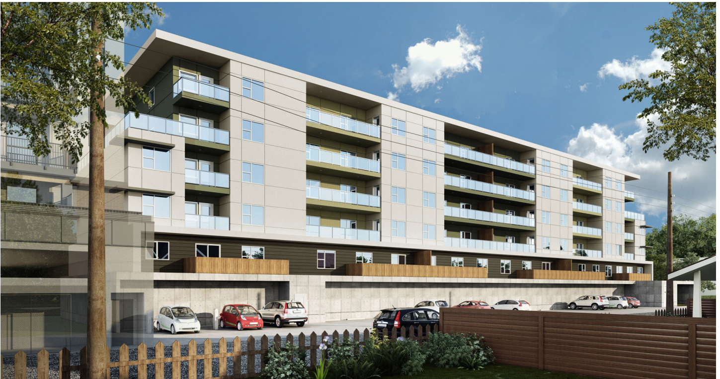
Rear of building looking at surface parking and south elevation of building.