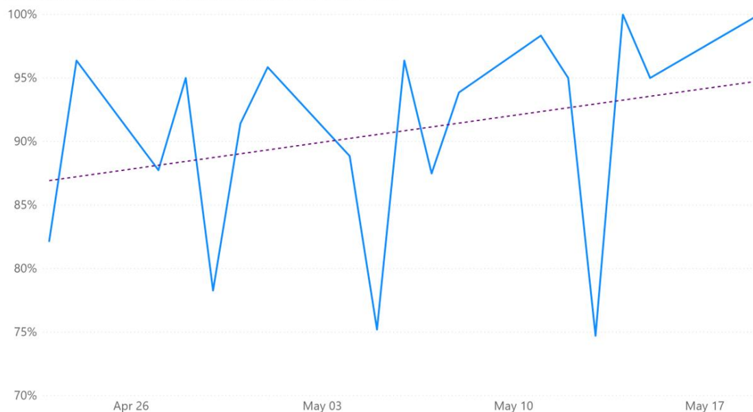
BERNARD AVE 200-400 (ZONE A) OCCUPANCY (%)