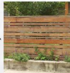
100% WOOD WALLS PER FENCE BOARD