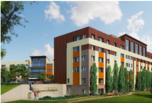
The Vineyards Lodge