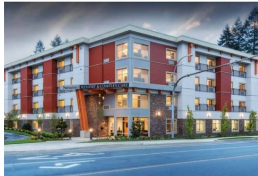
Nanaimo Memory Care