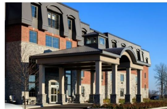
Orchard View by the Mississippi