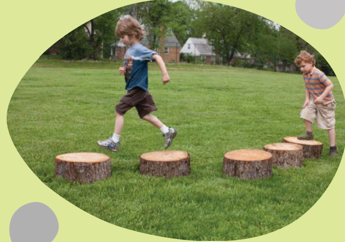
Innovative Design & Elements of Natural Play