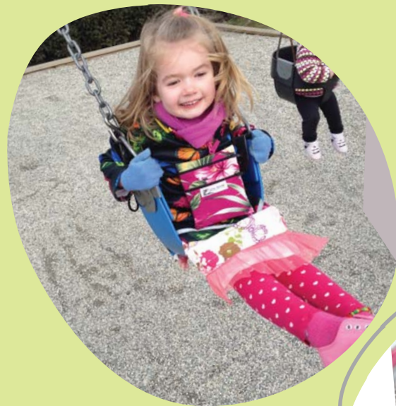
Dynamic Playground Equipment ages 0-12+