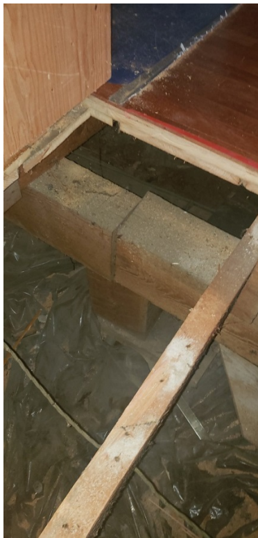
Existing wood foundation