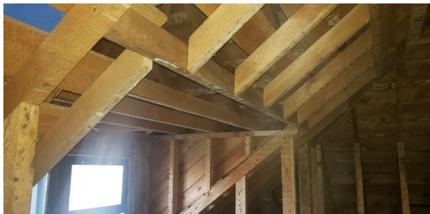
Existing roof assembly