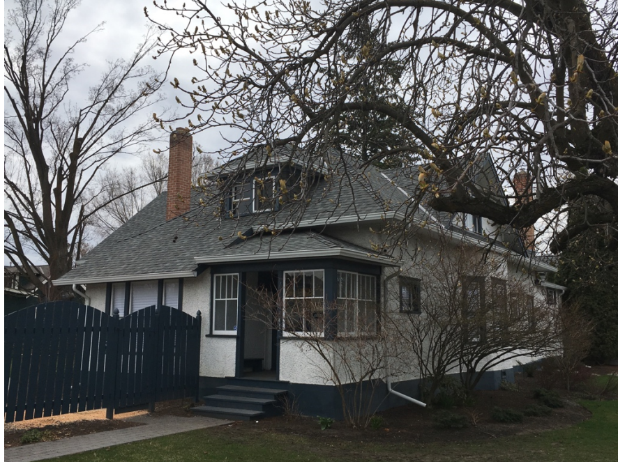
East Wing, Fireplace and Front porch to be removed as per approved HAP