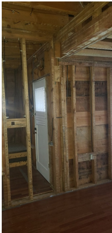
Interior after removal of Lath and Plaster