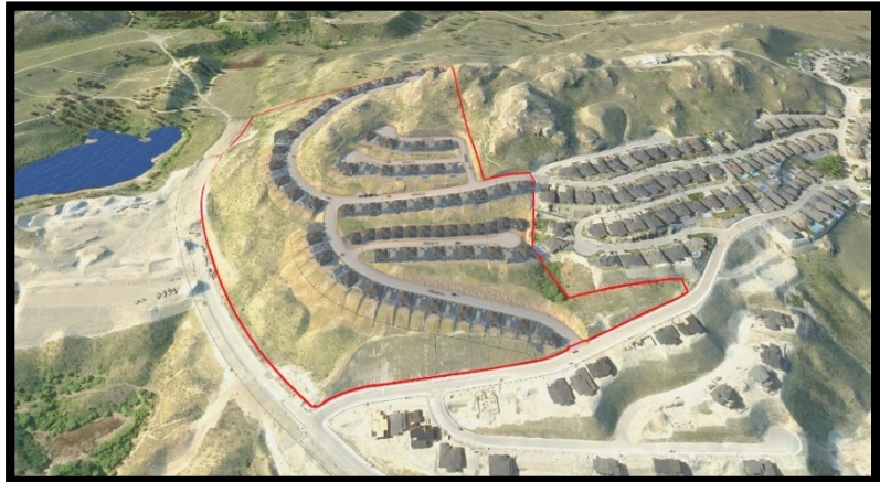
Proposed Subdivision Rendering

Should Council support the OCP amendments and rezoning, staff would work with the applicant through the subdivision process to address specific service requirements such as road standards, pedestrian connections, environmental restoration, and trails. Servicing requirements would be a condition of subdivision approval. Environmental and hazardous condition requirements will be addressed through the Development Permit process.