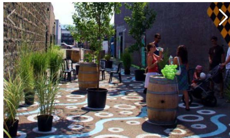
The Laneway Project - Perspective