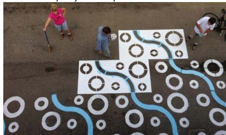
The Lane Project – Street Painting