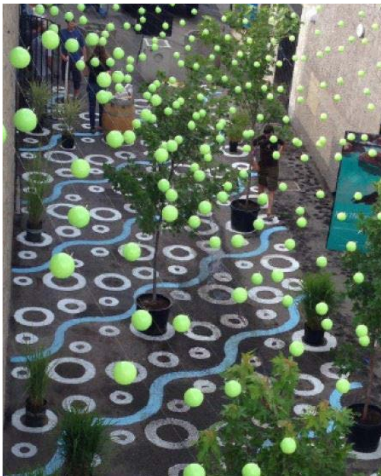
The Laneway - Perspective