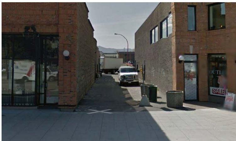
Street View of Site