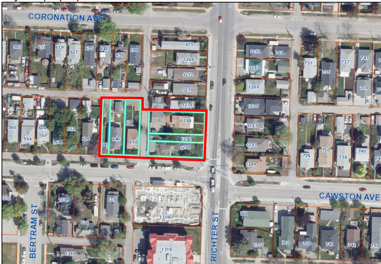
Subject Property Map: