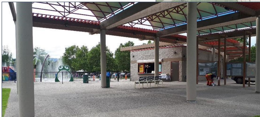
Two Accessible Picnic Tables under existing canopy