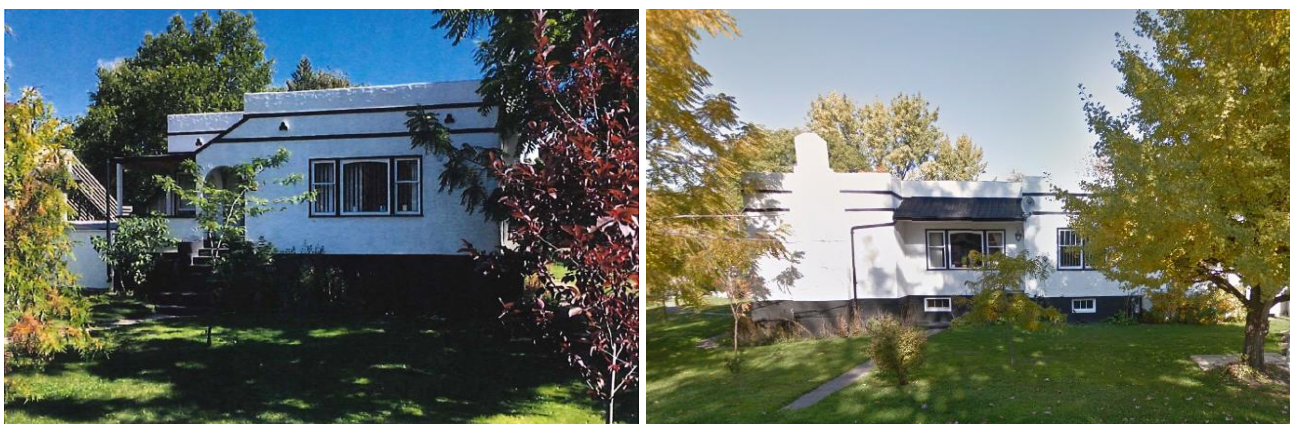
Figures 1 (left): Current eastern (Abbott Street) facing façade. Figure 2 (right): Current northern (Riverside Avenue) facing façade of Murchison House located at 1781 Abbotts Street.

Built in 1939 for prominent businessman Earle E. Murchison, the Abbott Street and Marshall Street Heritage Conservation Area Guidelines identify the Murchison House as a "Mediterranean Revival" style house. The Murchison House was built at a time when the "Abbott Street neighbourhood was mostly filled in with earlier residences, and so its non-conforming Moderne design contributes to the eclectic character of the area" 2 . Furthermore, the heritage value of the subject property and the heritage house "lies in the building's unique design, its association with Murchison and his business Orchard City Motors, as a long-term home for Murchison (1939 until his death in 1972), and for its unaltered exterior" 1 .