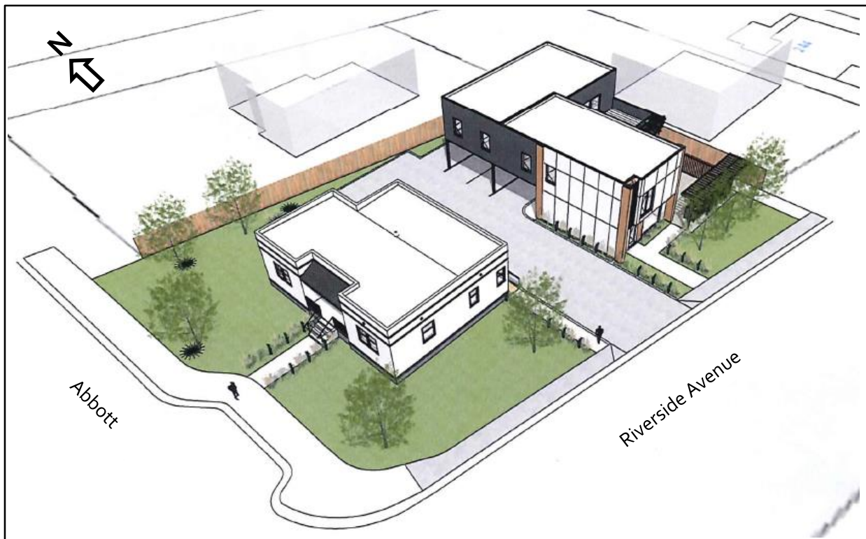
Figure 4: Rendering illustrating the proposed location of the Murchison House and the new dwelling on the subject property

The applicant has worked with Staff to improve both the on-site and boulevard landscape design. Landscaping on the property reflects elements of the Abbott Street Recreational Corridor streetscaping. A row of small deciduous trees will be planted along the eastern property boundary to create privacy with other trees on the site creating attractive outdoor spaces for both the neighbouring property to the east and the proposed new infill housing. Additionally, a medium deciduous feature tree will be located at the northwestern corner of the property creating an inviting outdoor sitting area. Similar level of attention is given to the boulevard landscaping improvements along Riverside Avenue. Taking inspiration from the Abbott Street multi-recreational corridor design, the sidewalk to be constructed along Riverside Avenue will be inset with boulevard trees planted adjacent to the road, thus buffering pedestrians from the road and adding shade to the sidewalk.