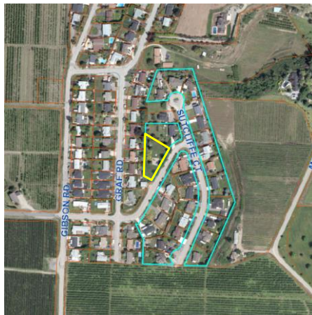
2019 – Blue properties to be rezoned to RU1 Yellow property to be rezoned to P3

The picture above shows that the development existed prior to August 10, 1976. This shows that the current zoning, RR3 – Rural Residential 3, does not fit within the established neighbourhood. Staff are proposing to adopt the RU1 – Large Lot Housing and P3 – Parks & Open Space zones as the new underlying zones to the subject properties identified in Schedule 'B' and 'C'. One of the 27 properties current use is a park and thus is proposed to adopt the P3 zone.