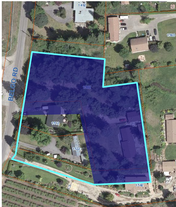
RR2 Property (Refer to Schedule 'B')

Staff are bringing forth and recommending this Land Use Contract (LUC 76-1067) be terminated and for the subject properties to be rezoned. The underlying zone is RU1 – Large Lot Housing and does not fit in the established neighborhood. Under the current Land Use Contract its uses are regulated in accordance with the R-1 zone in former Zoning Bylaw No. 4500. The Zoning Bylaw has since been updated and obtains different uses, requirements and zonings. The equivalent of R-1 in the current Zoning Bylaw, No. 8000, is RU1 – Large Lot Housing. However, RU1 zoning is not adequate as the subject properties are not connected to sewer. All urban zones according to the Official Community Plan must be in the Permanent Growth Boundary and connected to services. Therefore, Staff are proposing to adopt RR2 – Rural Residential 2 and RR3 – Rural Residential 3 to the subject properties. Two zones are being proposed due to the varied lot sizes.