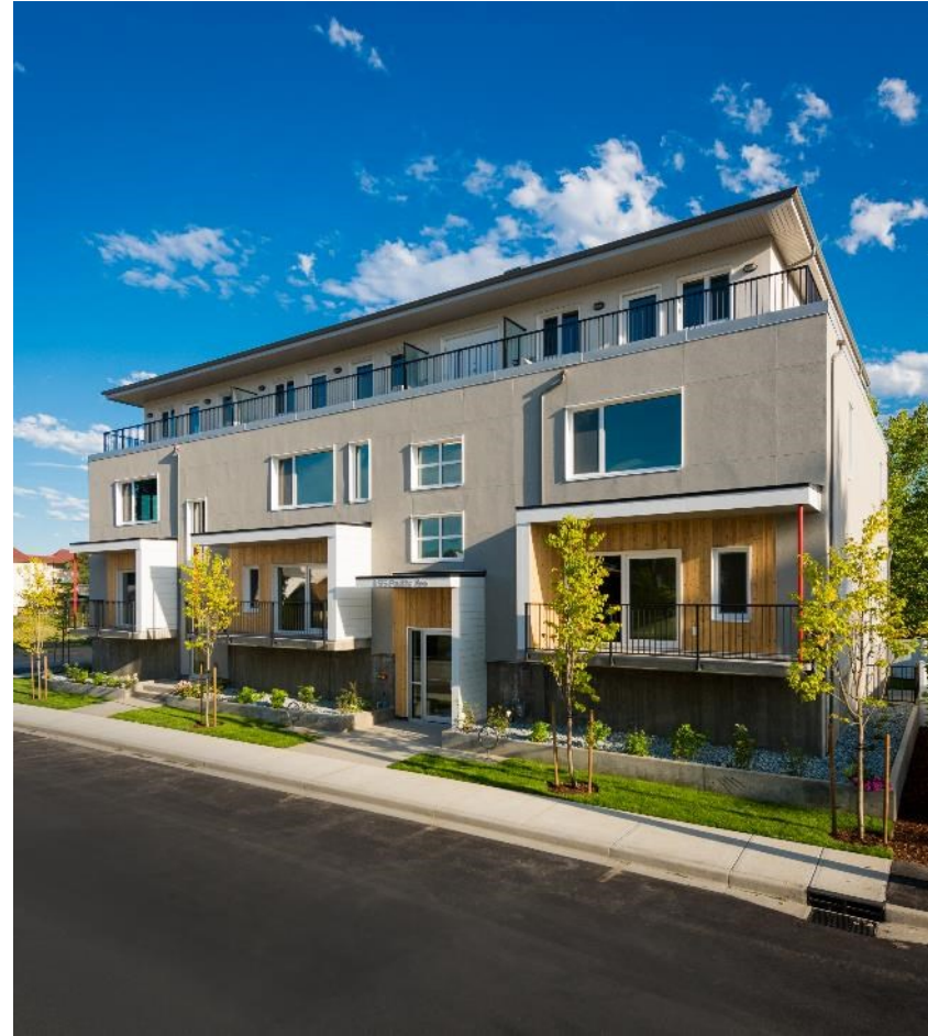
Market Rental Project at 1155 Pacific Ave