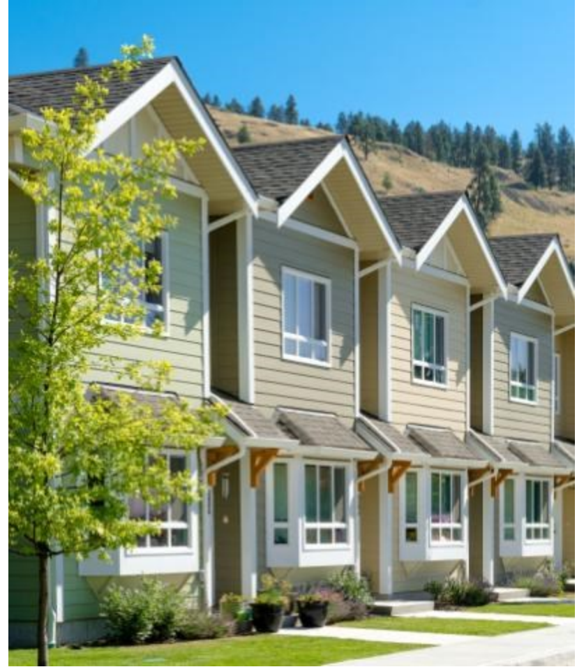
Non-market rentals (Pleasantvale Project)