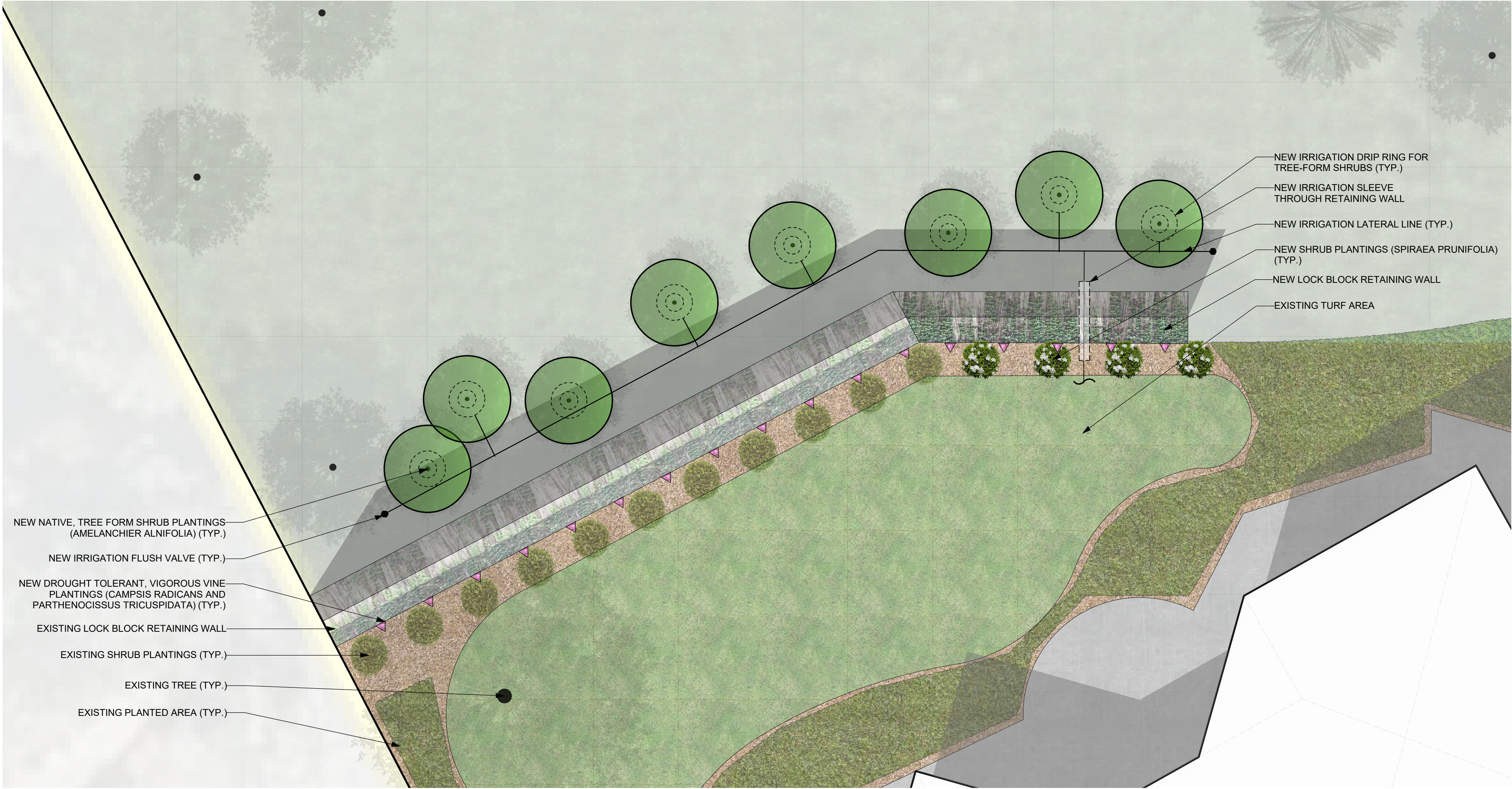
RETAINING WALL PLAN SCALE 1:75