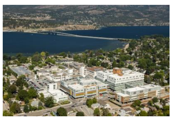
Hospital services (inpatient & outpatient)

Example: Community Health and Services Centre