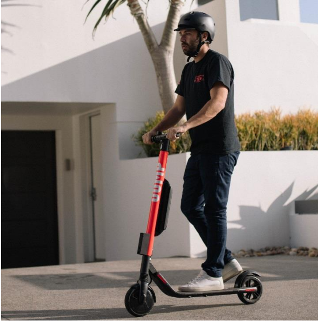
Figure 1: Jump electric scooter. Jump is Uber's bikeshare brand. 1