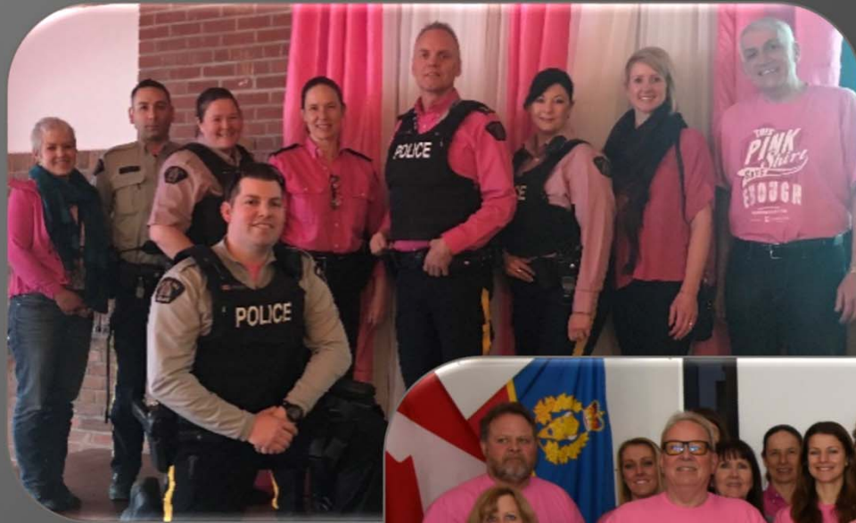
Pink Shirt Day 2019