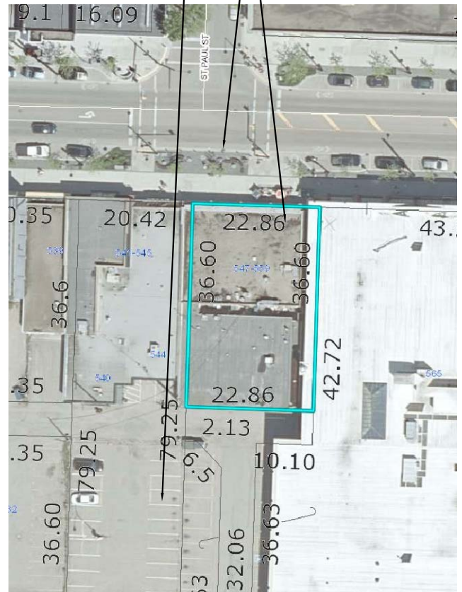
city map NTS

GLA = 717 SQ. M. GFA = 674 SQ. M. NFA = 717 SQ. M.