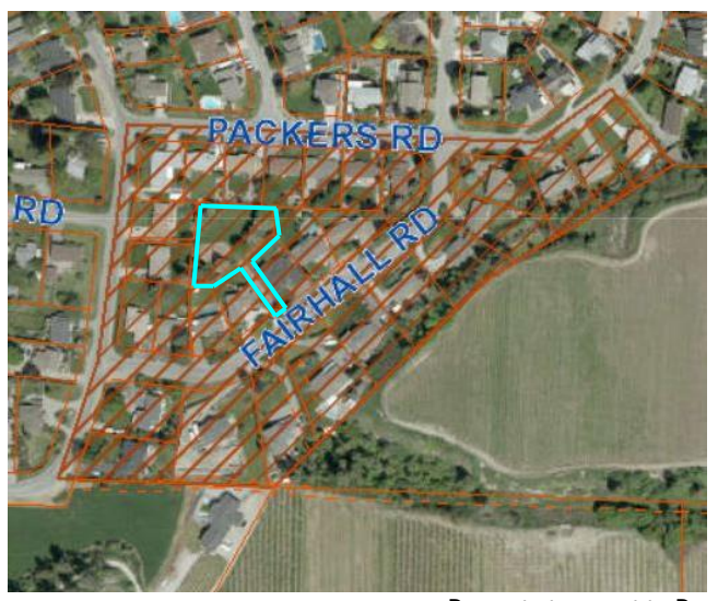
Properties to revert to RR3