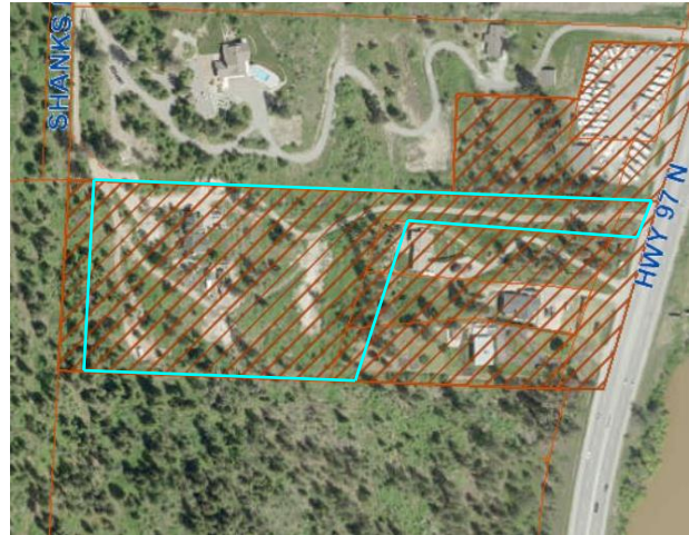
Property to revert to A1

The Land Use Contract uses and regulations fit within the A1 and RR2 zone.