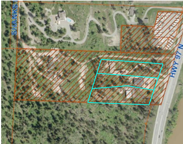
Properties to revert to RR2

The underlying zoning (A1 – Agriculture 1 and RR2 – Rural Residential 2) fits with the established neighbourhood and is an appropriate zone for the existing land use. Staff are suggesting that 7770, 7782, and 7800 Hwy 97 N revert to the underlying zone RR2 – Rural Residential and that 7810 Hwy 97 N revert to the underlying zone A1 – Agriculture 1.