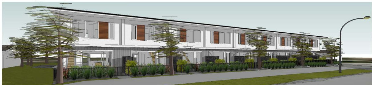
FRONT ELEVATION - NORTH - FACING HOUGHTON ROAD