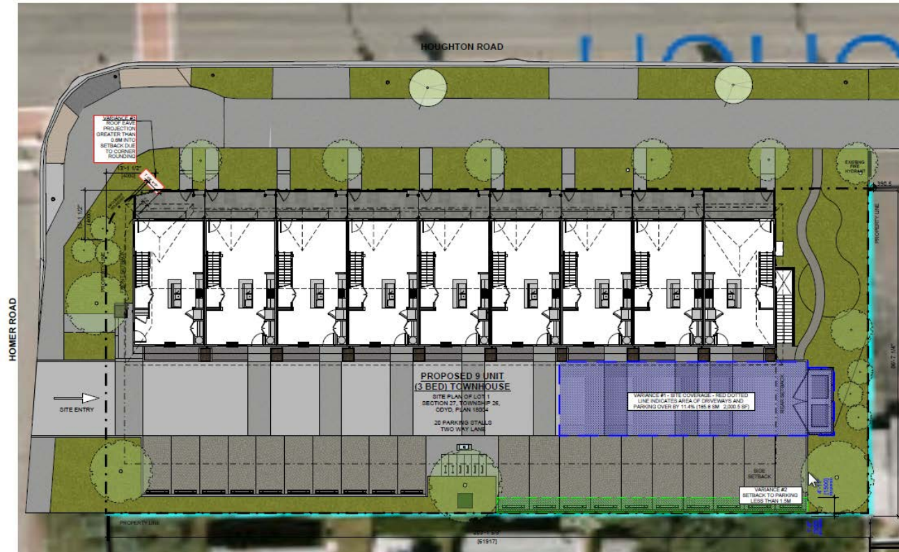
Figure 1: Variances

In fulfillment of Council Policy No. 367 respecting public consultation, the applicant notified all of the neighbours within a 50 metre radius. The applicant further attended a Rutland Residents Association meeting on Thursday, September 24 th 2015 to discuss the project.