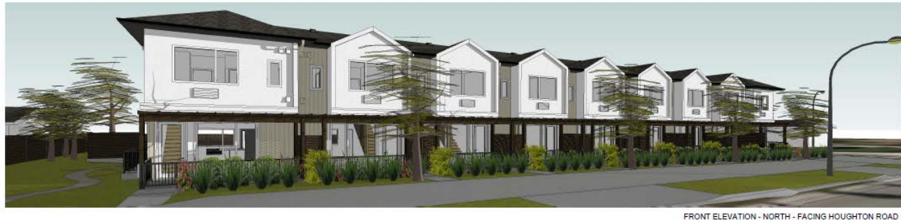
Figure 3: Current Design

The finish materials include white acrylic stucco with cement board cladding, fiberglass shingles, white vinyl windows, and aluminum picket railings along the Houghton Road frontage. Screening material includes landscape features and wood privacy fencing. The patios on Houghton Road will include timber trellis and adequate landscape features to create an appropriate transition from the private realm to the public realm.