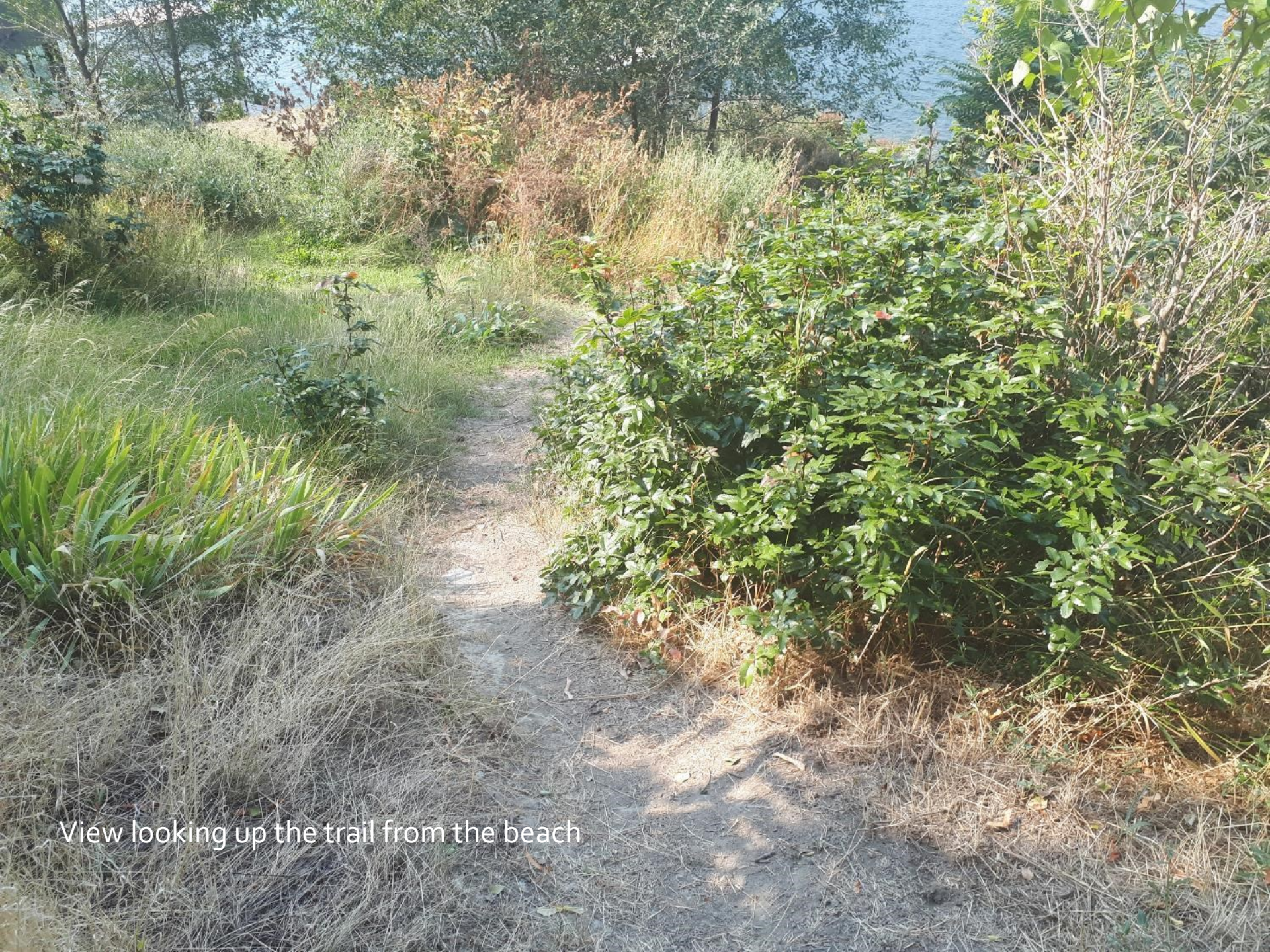
View looking up the trail from the beach