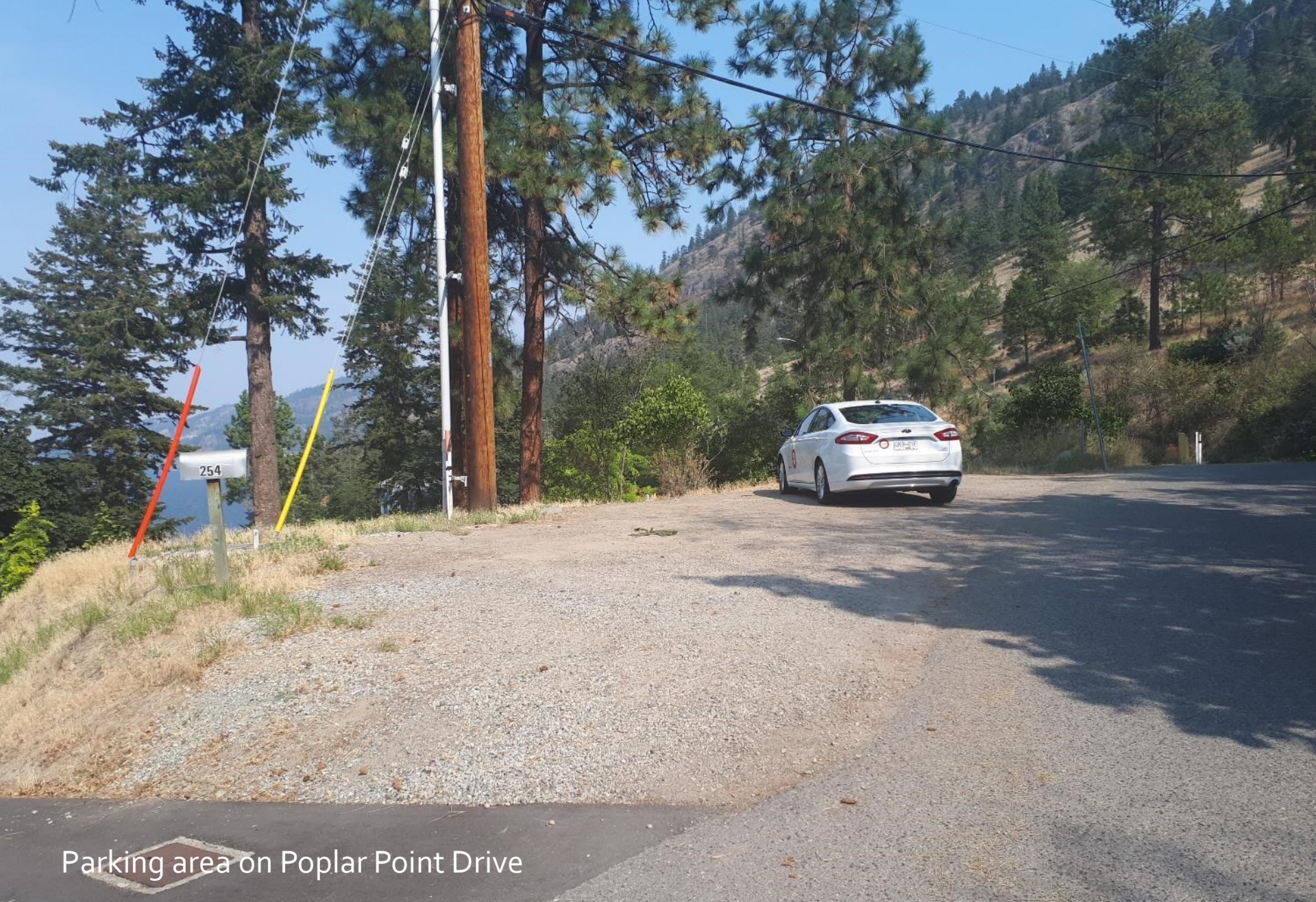
Parking area on Poplar Point Drive