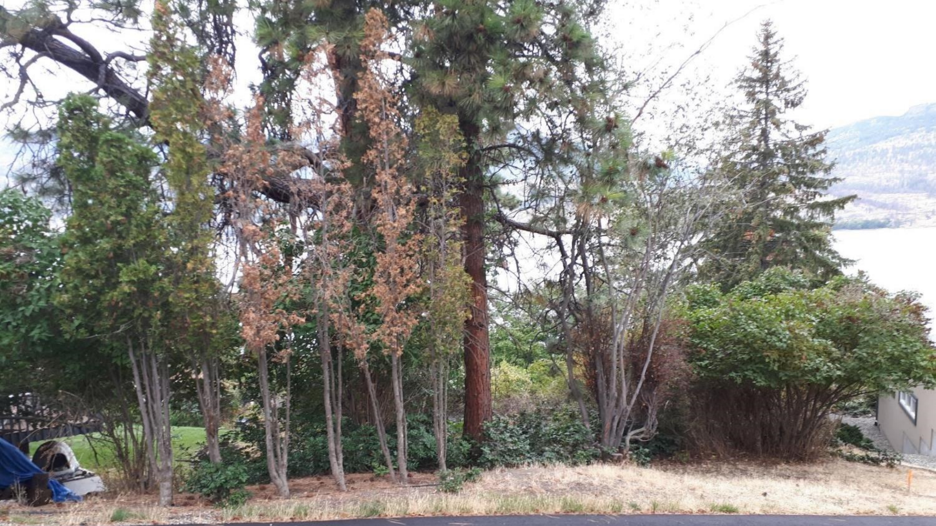
Frontage on Poplar Point Drive