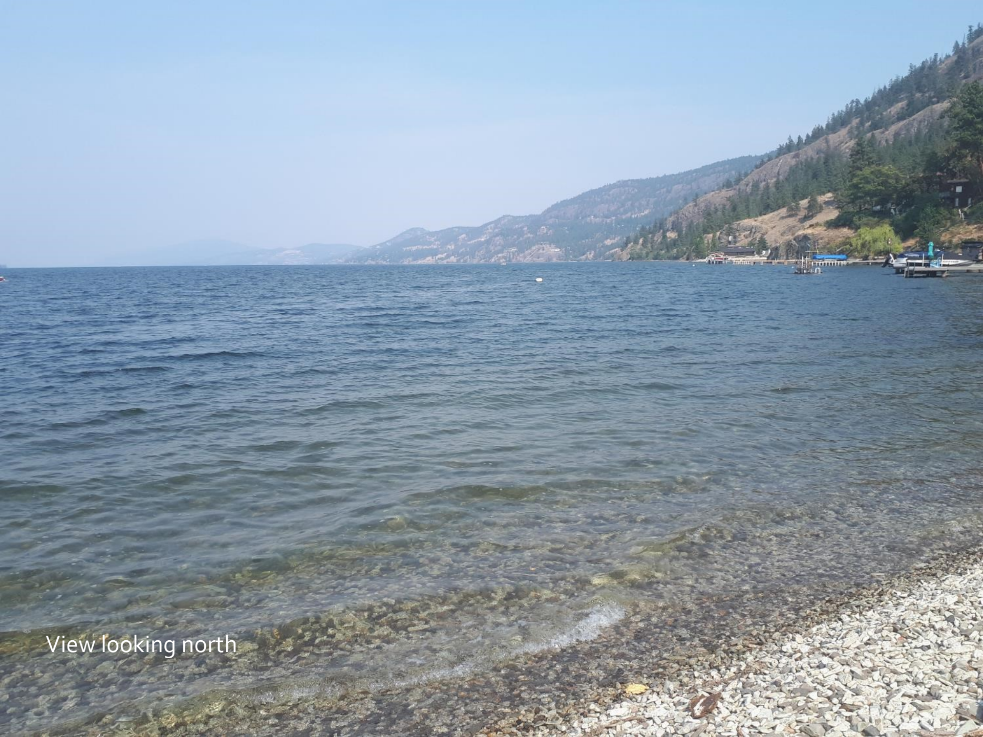
View looking north