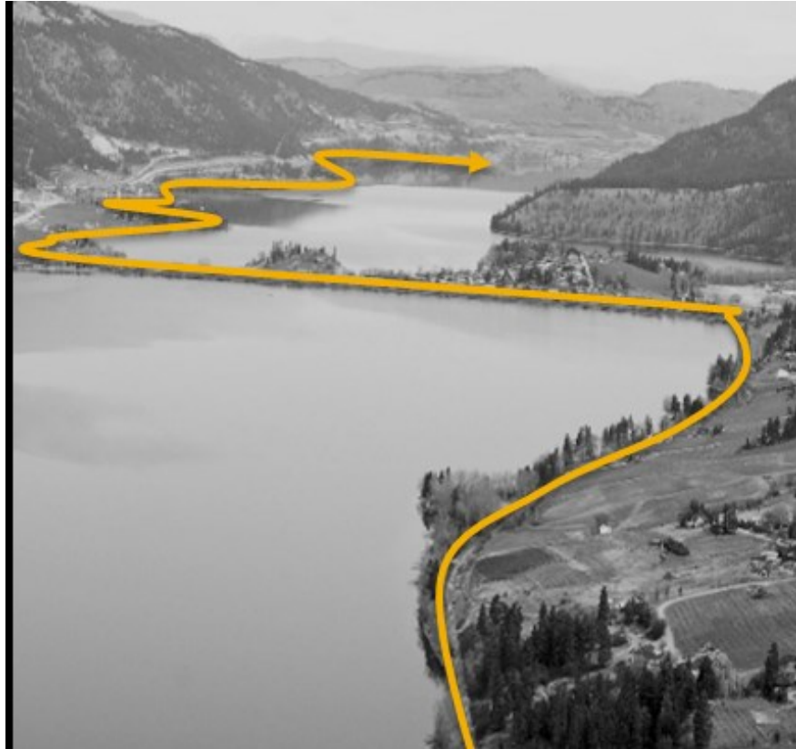
City of Kelowna